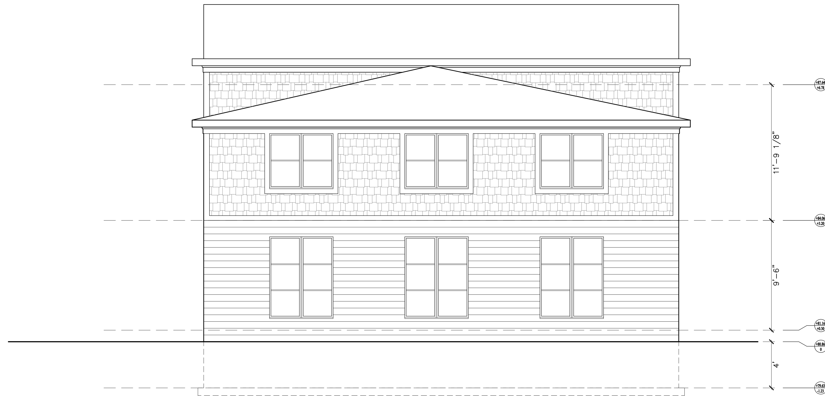
MILL STREET ELEVATION