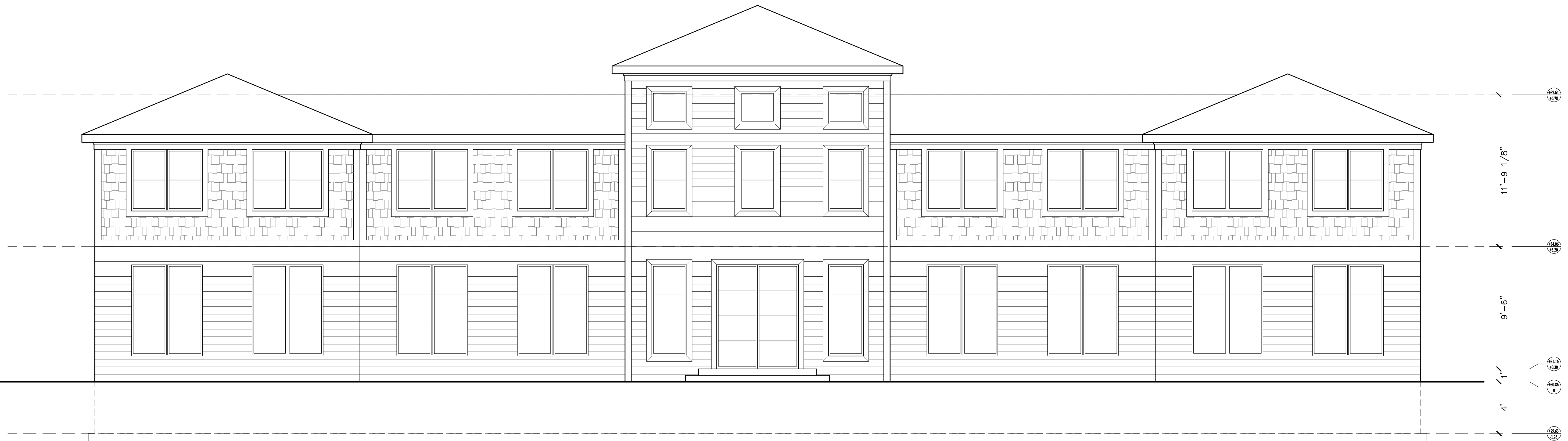
CLARENCE STREET ELEVATION