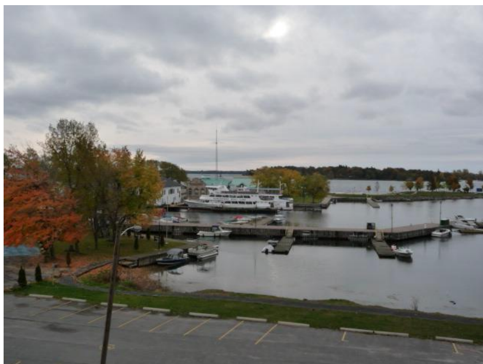
Figure 16 : Gananoque Pump House and environs, viewed from the northwest from Church Street (photo E. Tumak, Oct. 2009). The northwest gable of the Pump House facing St. Lawrence Street is by the front of the large tour boat.

stack for the steam-powered engines no longer remains. As a tall structure, the brick chimney, somewhat imitated a traditional Italian campanile (bell or watch tower), could be seen from quite a distance, and served as a navigational landmark. 17 The smoke stacks with the former Hamilton and Kingston pump houses are still extant.