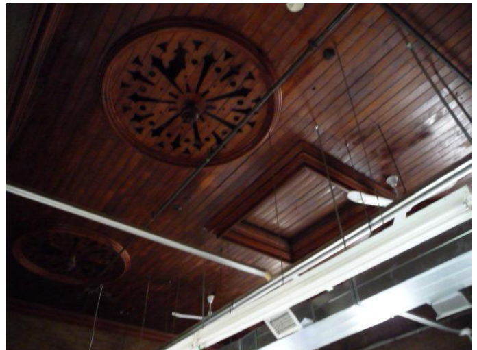
Figures 10-12: left – Gananoque Pump House, interior paralleling Kate Street; right – ceiling of chamber paralleling Kate Street; top of next page – detail of ceiling (photos E. Tumak, July 2009).