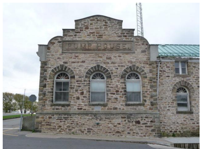
Figures 3-4: left – Gananoque Pump House, viewed from the north, with the northeast/Kate Street elevation on the left, and the northwest/St. Lawrence Street elevation on the right; right – north gable viewed from St. Lawrence Street.