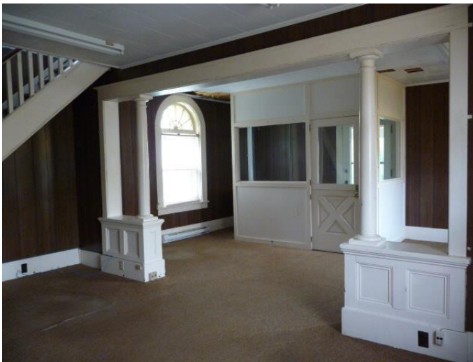
Figure 13: left – Gananoque Pump House, ground level interior of the engineer's residential accommodation, constructed 1925-26, looking towards the exterior entrance (photo E. Tumak, July 2009).

The interior of the original building has distinguishing features, notably the chamber that parallels Kate Street (Figures 10-12). It is faced with brick and has six large circular vents cut decoratively into the wood ceiling—both features addressed the needs of the steam powered engines that provided the pumping operation. Brick was both durable and offered fire resistance for the hazard associated with steam engines, and the ceiling vents released heat and steam into the attic which was then expelled through the rooftop ventilating cupolas. In the middle of the ceiling is a trap door, surrounded by a well-defined wood frame, which gave access to the attic. None of the pumping machinery remains in this or the room adjoining to the southwest/closer to Water Street.