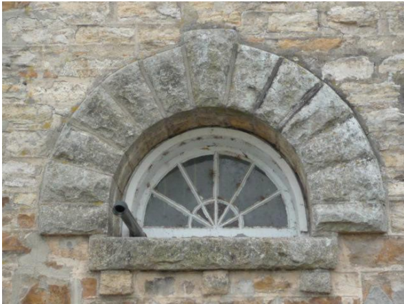
Figure 5: left – Gananoque Pump House, window detail of the northeast/Kate Street elevation.

Flemish- or Dutch-like gables create pavilions at the southeast and northeast corners, and add notable distinction to the building (with ashlar forming the bottom step of the gables). The northeast pavilion is further distinguished by the large carved inscription of “Pump House” at the gable level. Below the middle window of this gabled façade is a plaque of historical whimsy noting the landing in Gananoque of figures of great significance to the exploration and settlement of Canada by Europeans: LaSalle and Frontenac in 1673, Joel Stone in 1785 and 1792, and Gov. Simcoe and wife in 1792.