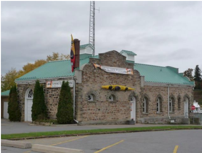
Figure 1: Gananoque Pump House, viewed from the east, with the northeast/Kate St. elevation on the right, and the southeast elevation (towards Water St.) on the left (photo E. Tumak, Oct. 2009).