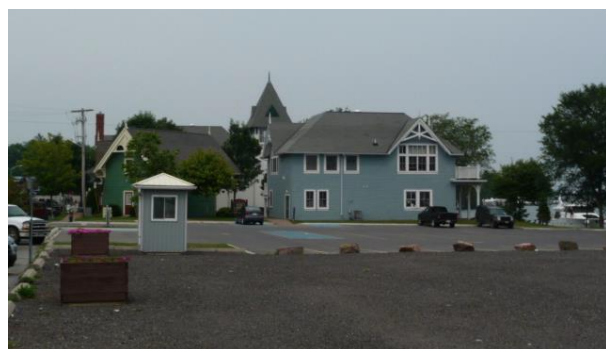
Figures 19-20: Gananoque Pump House environs – left, looking north from the upper level of the porch of the 1925-26 section; and right, looking east (photos E. Tumak, July 2009).