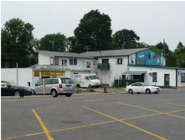
Figure 21: Gananoque Pump House environs looking north (photo E. Tumak, July 2009).