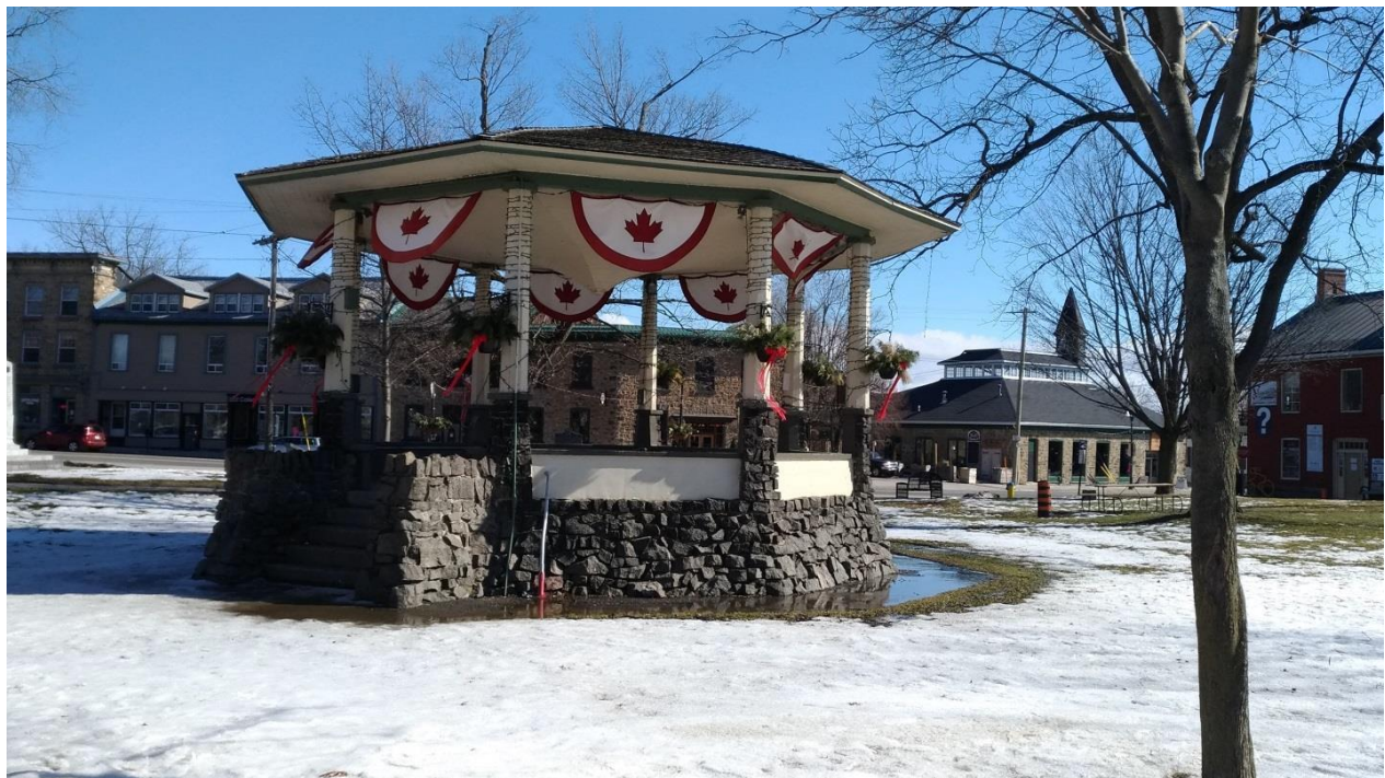
Figure 2: Gananoque Bandshell, 30 King Street East, viewed from the north.