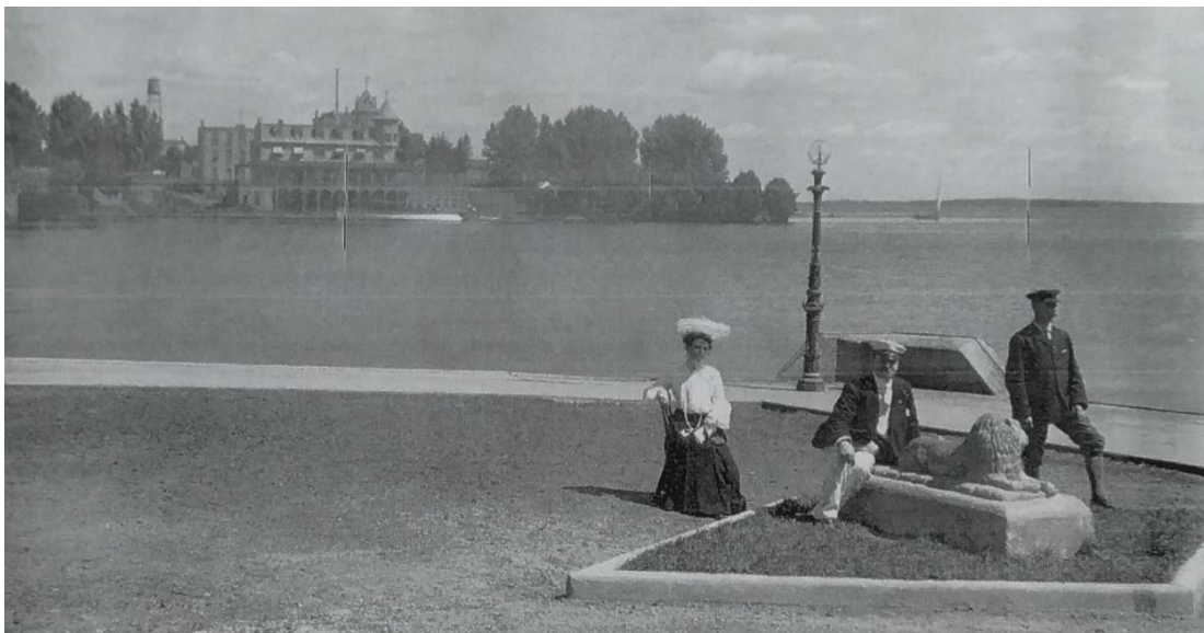
Figure 16: View from 1905, southeast of the Customs Building with the lion statue in its original location (at the south end of Main Street) looking east towards the Gananoque Inn (A. Marsden Kemp Collection, Archives of Ontario, printed in Gananoque Historical Society Newsletter, Sept. 2016, no. 66, p. 1795).

The small statue of the lion, now resting in the Town Hall Park, was originally on display at the waterfront to the southeast of the former Customs Building. It was removed around 1920 and relocated back to Gananoque in 1979, where it had been in Mallorytown for unknown reasons. 23