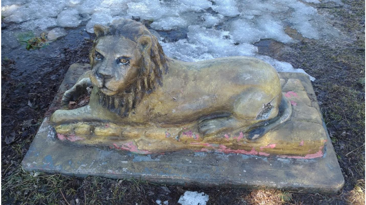
Figure 6: Lion statue, Town Hall Park grounds, previously located southeast of the former Customs Building at the south end of Main Street, Gananoque (E. Tumak, Feb. 2020).