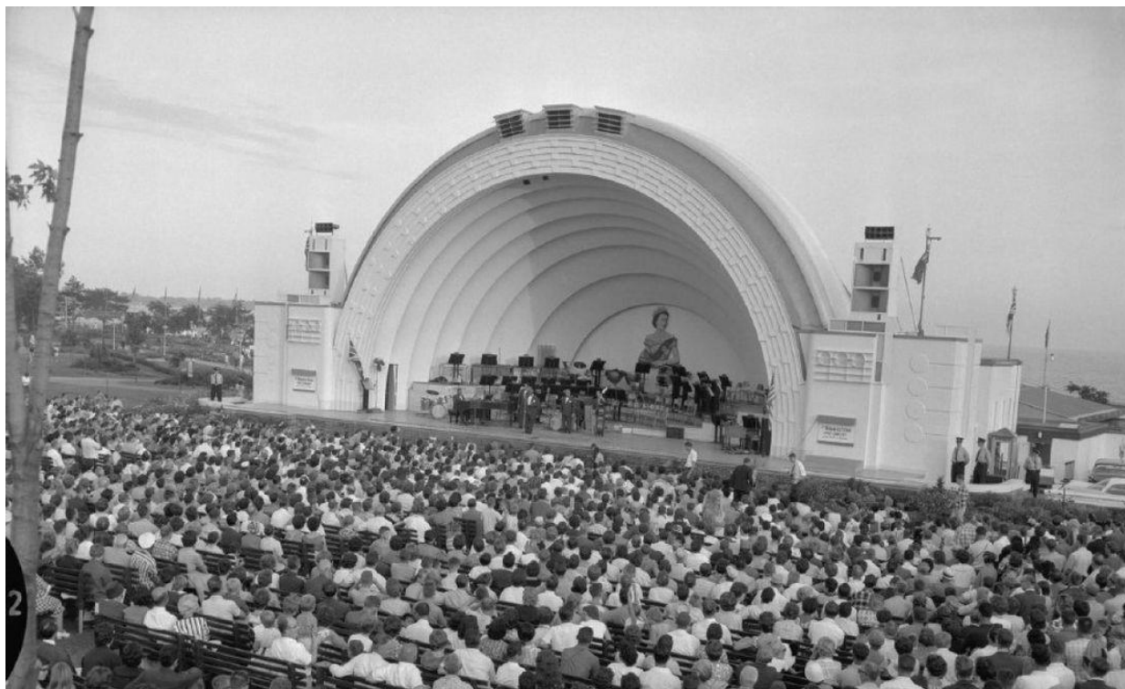
Figure 9: The Canadian National Exhibition Bandshell, built 1936, Toronto, Ontario, designed by Craig and Madill architects (ca. 1965, source https://www.google.com/search?rlz=1C1LDJZ_enCA577CA578&sxsrf=ACYBGNR7xzEEqCYvnG7ZlvLcChg-m-WZfw:1583101362715&q=CNE+Bandshell&stick=H4sIAAAAAAAAAAONqecTYw8gt8PLHPWGpJsZJa05eY6zh4qrOyC93zSvJLKKU0uNiq7JUuASlePXT9Q0Nk8ozktJKcjI0GKT4uVCFIOyMjHZdmnaOTUfQ0MDvCTNvkIOUjIJQF7tnsU9-cmKOYPUz8yO2i2_aK3FyMjAwPHg-fYW9FkPTvhWH2Fq4GAUYeBax8jr7uSo4JealFGek5uQAAPA-9YqiAAAA&sa=X&ved=2ahUKEwiDtfiSqPrnAhWFZd8KHc0RC_sQ6RMwFXoECA4QCA&biw=1366&bih=62 , accessed Feb. 2020).