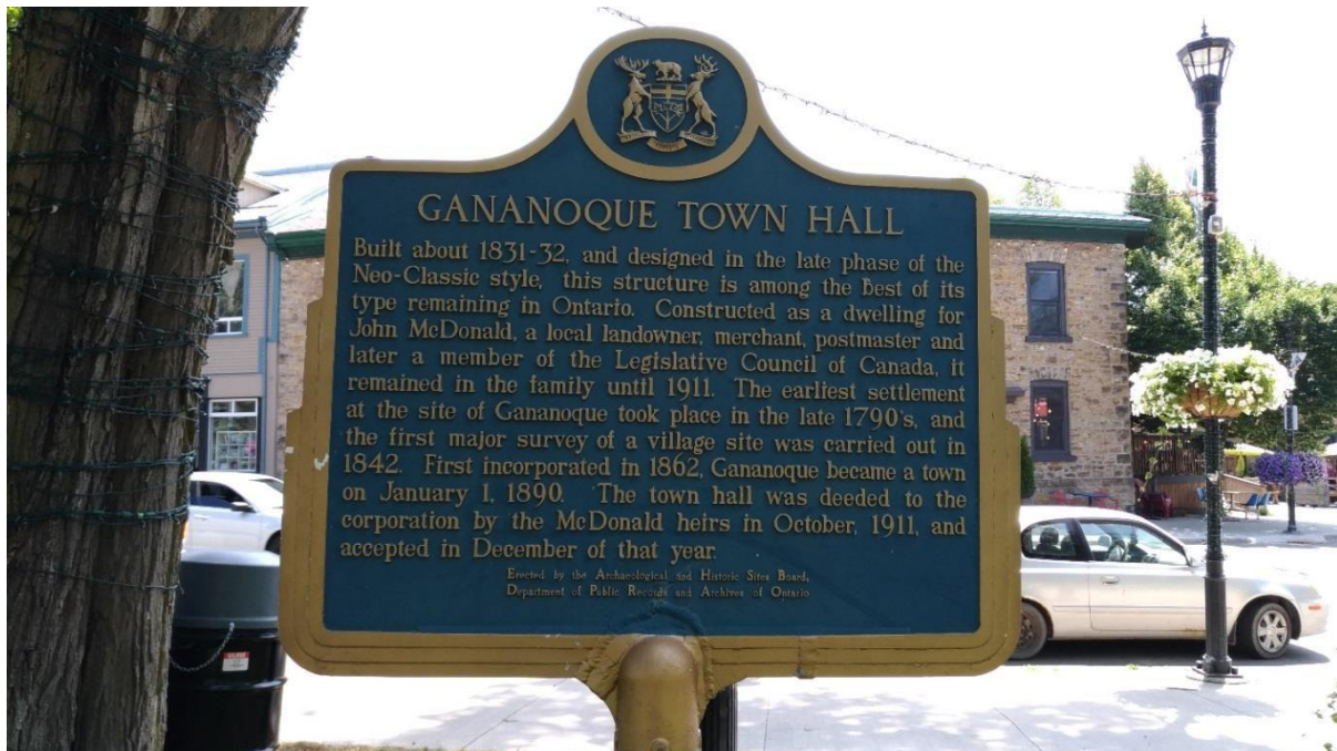
Figure 7: 30 King Street East, Provincial heritage plaque for Gananoque Town Hall (E. Tumak, July 2019).