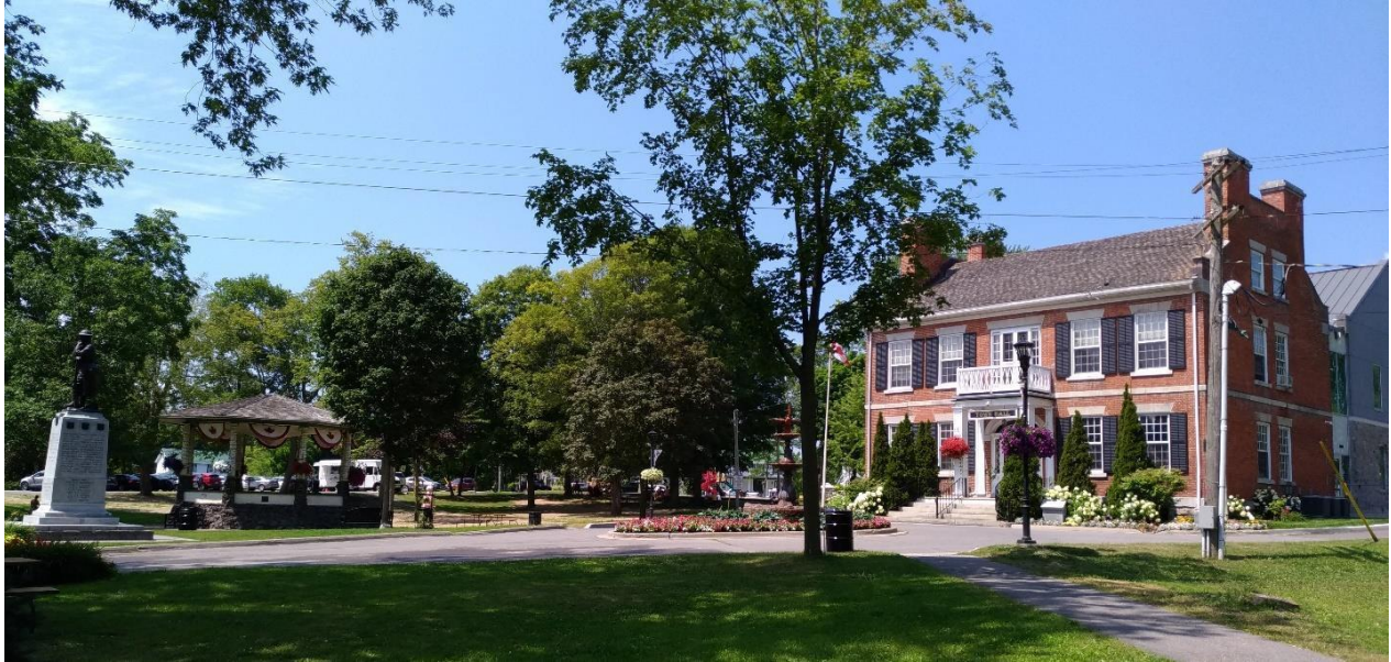
Figure 8: 30 King Street East, Gananoque Town Hall Park, viewed from the southeast, to the left/south is the 1920 Soldier's Memorial, the Bandshell, the fountain, and Town Hall (E. Tumak, July 2019).

The term bandshell used in Gananoque-Kingston seems to be a localised term. More commonly this type of structure is called a bandstand. 1 A bandshell looks like a shell, and was inspired by the Art Deco style Hollywood Bowl of 1928, which was broadly copied elsewhere, such as at the Canadian National Exhibition grounds, Toronto, Canada.