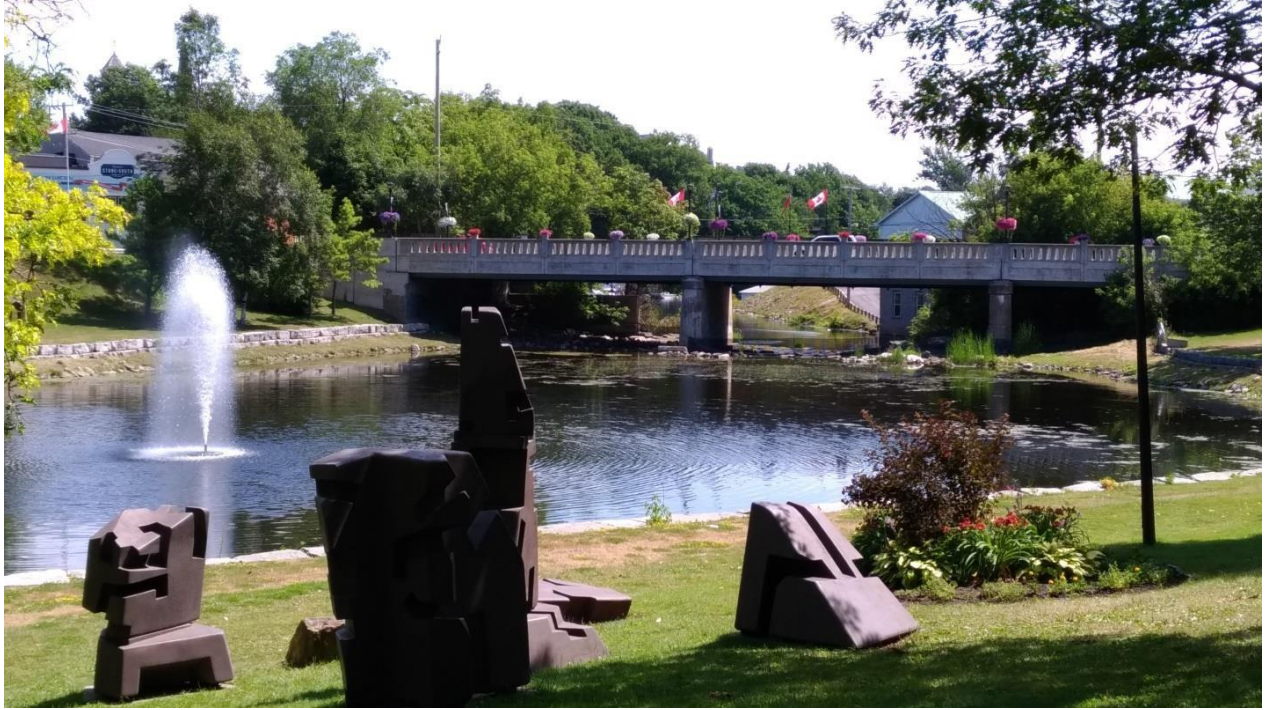
Figure 19: King Street Bridge, viewed from the northwest (E. Tumak, July 2019).