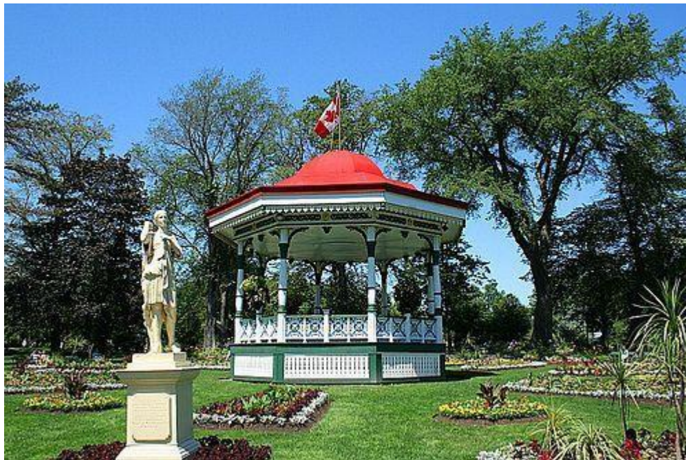
Figure 10: Bandstand, Halifax Public Gardens, 1887

The gazebo bandstands were generally octagonal structures with various stylistic overlays popular at the time or the region, and could include exotic stylistic trends such as Moorish. One of the earliest examples of an extant gazebo bandstand form in Canada is in the Halifax Public Gardens.