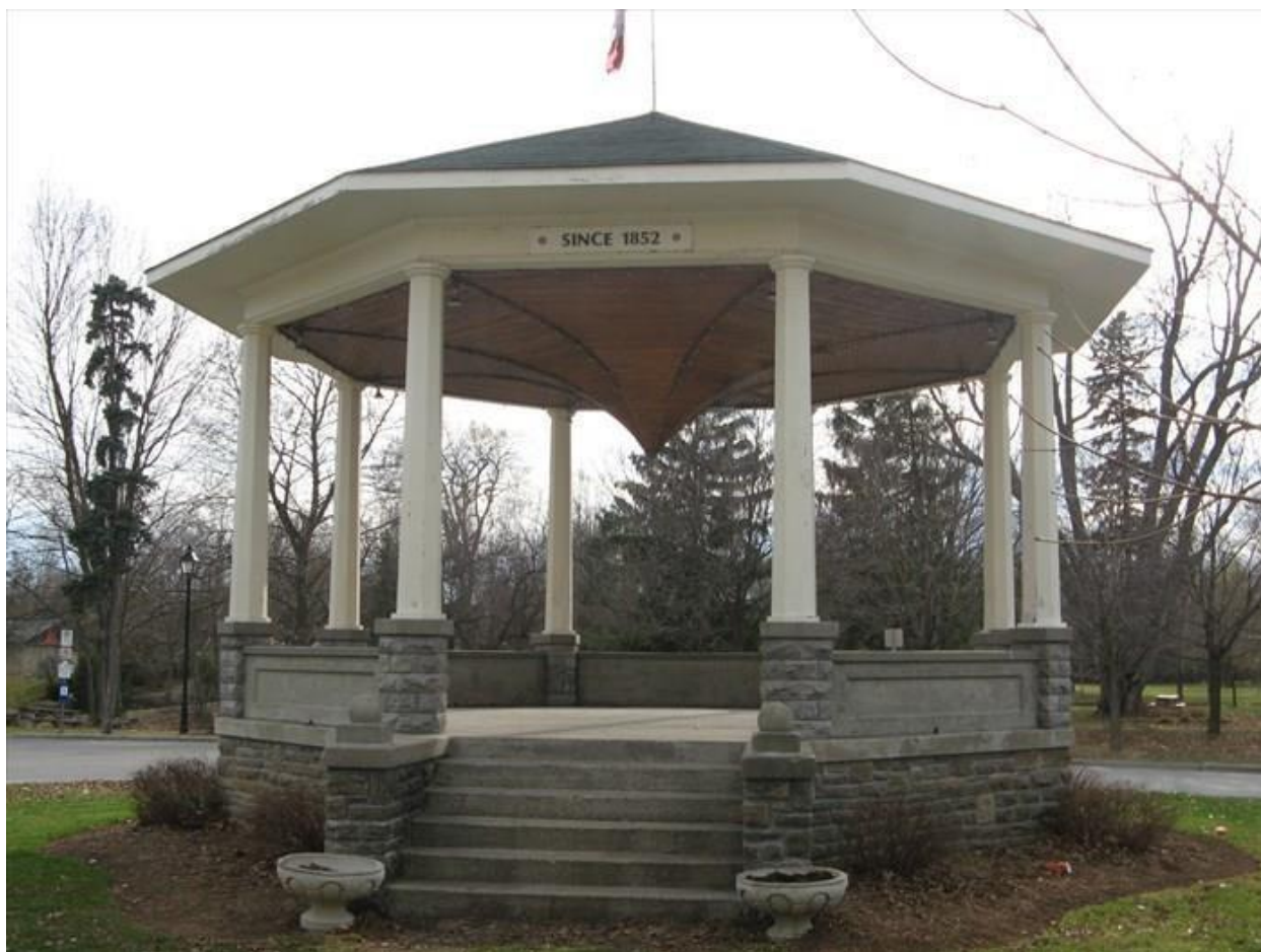
Figure 11: Bandstand, Perth, Ontario, ca. 1930s

( https://www.waymarking.com/gallery/image.aspx?f=1&guid=3d9c0f71-43e5-4715-a626-df5195baae4a&gid=3 , accessed Feb. 2020).