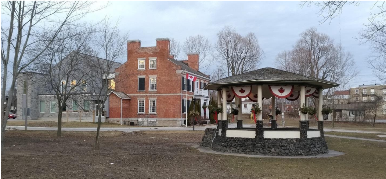
Figure 1: Gananoque Bandshell, 30 King Street East, viewed from the west, with Town Hall in the background (E. Tumak, March 2020).