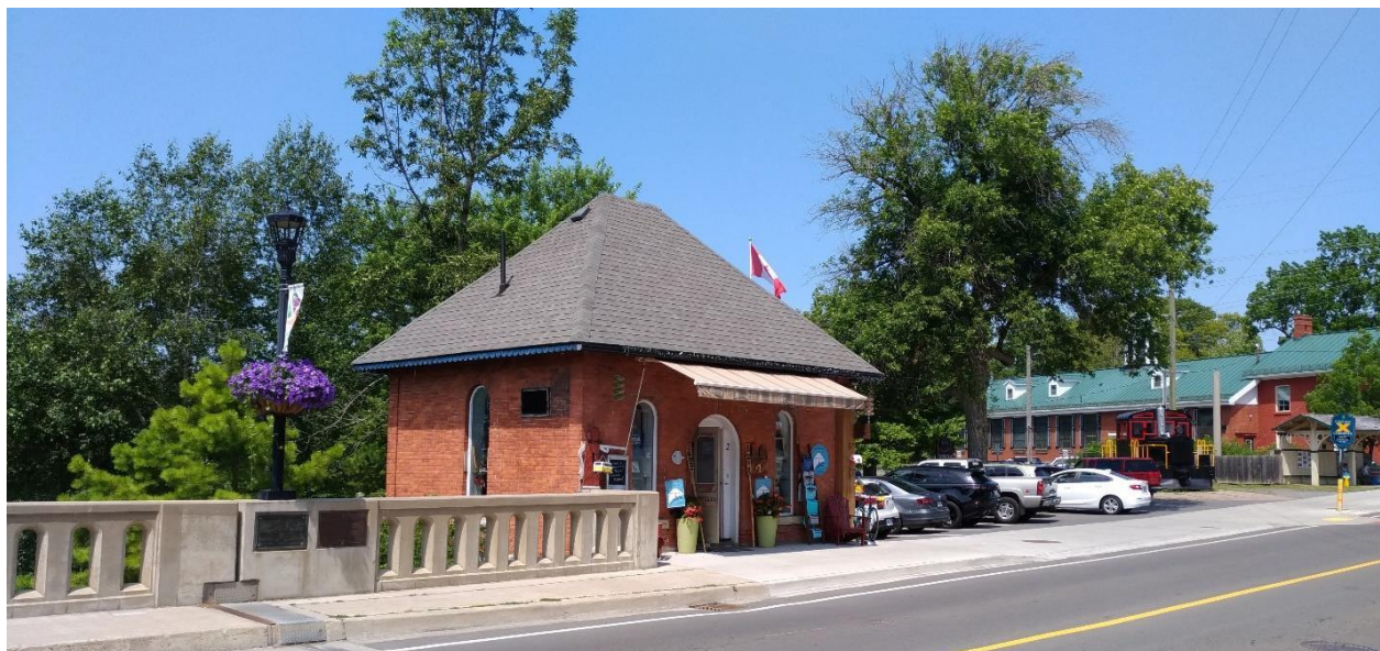
Figure 17: 2 King Street East, viewed from the southwest with the north side of the King Street Bridge (E. Tumak, July 2019).