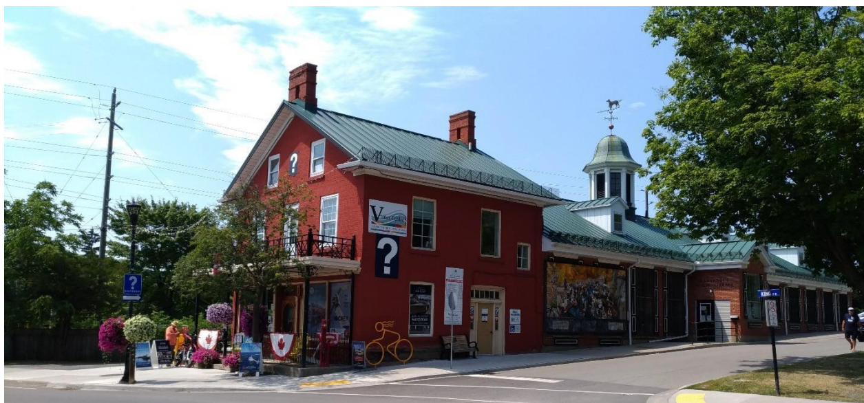
Figure 18: 10 King Street East, viewed from the southeast with the Visitor Information Centre and Archives/Museum Storage, with the Library further to the right/north.