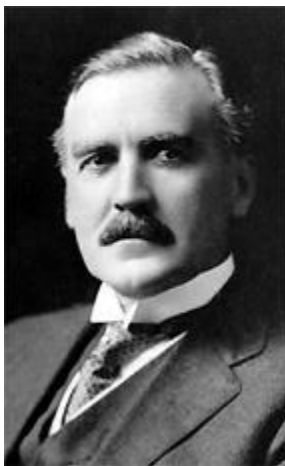
Figure 15: Right Hon. Sir William Thomas White, n.d. (Wikipedia, https://en.wikipedia.org/wiki/William_Thomas_White , accessed July 2019).

The fountain was donated by the Right Hon. Sir William Thomas White (1866-1955), Minister of Finance and Member of Parliament 1911-21, and from November 1918 – May 1919, Acting Prime Minister while Prime Minister Borden was in Europe for the Treaty of Versailles. 22 Although he had never held a seat in the House of Commons, or even campaigned for public office before, after winning the general election of 1911, Prime Minister Borden appointed White as his Minister of Finance, and White was elected by acclamation in a by-election in the riding of Leeds after its member 'offered' to resign.