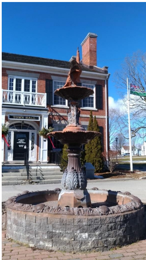
Figures 3-4: left – Gananoque Town Hall Fountain; and right – Gananoque Monument to the Unknown Soldier.