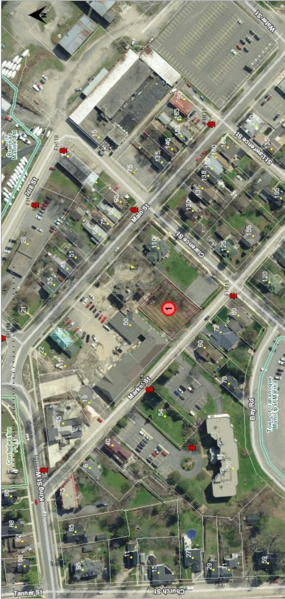
Map Printed On 2018-01-31 17:20

Disclaimer This map is illustrative only. Do not rely on it as being a precise indicator of routes, locations of features, nor as a guide to navigation. Designed and produced by: United Counties of Leeds & Grenville. Source of information: UTM, Grid Zone 18, NAD 1983, with data supplied under licence by members of the Ontario Geospatial Data Exchange (OGDE), and Teranet inc. Queens Printer of Ontario.