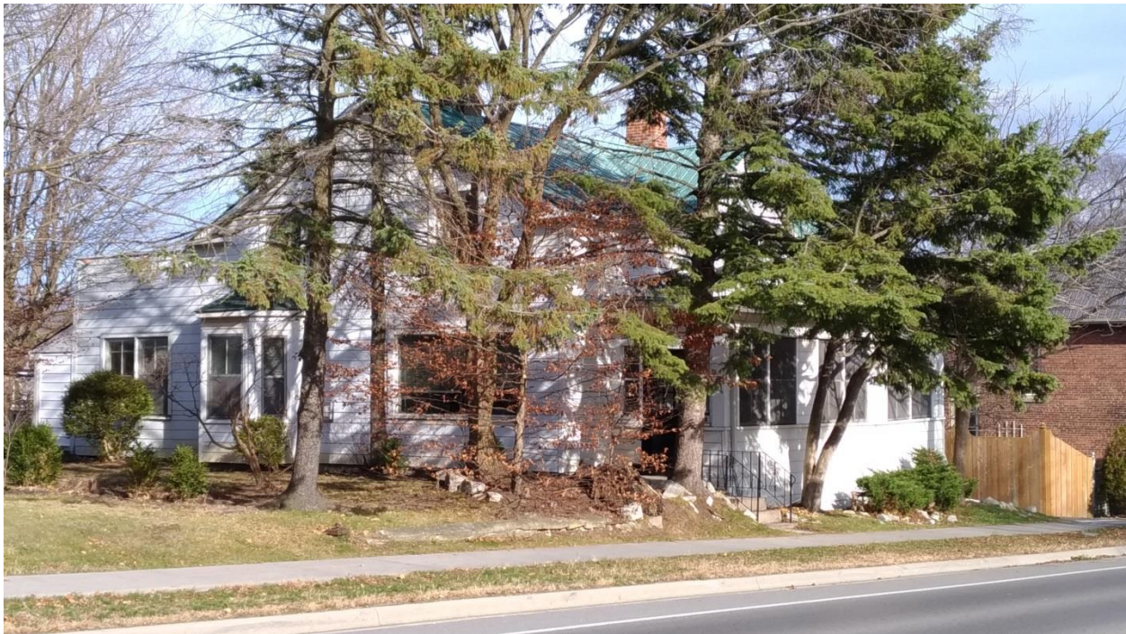
Figure 6: 120 King Street West, viewed from the southwest (E. Tumak, Nov. 2020).

Originally, the residence had not less than 9 fireplaces, and one oven. This was quite a number of heating sources for any house of such modest size at the time.