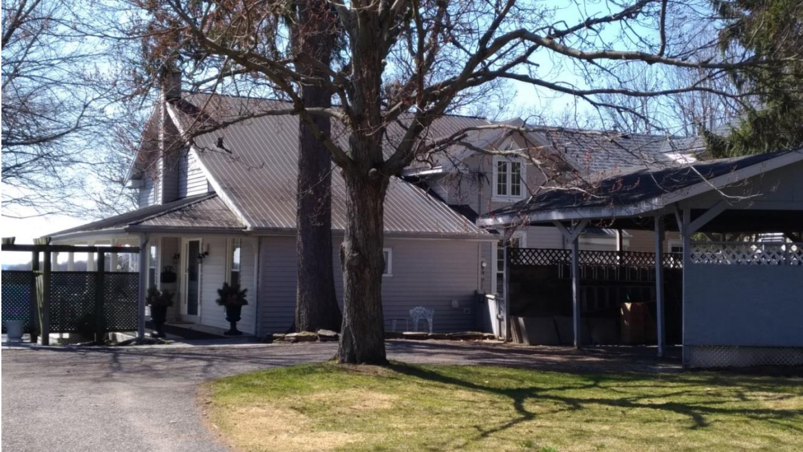
Figure 8: 70 Church Street, Beaumont House, viewed from the north, showing a triangular topped window in the upper level. A matching upper level triangular topped window is on the opposite south side (Edgar Tumak, April 2021).

Several other Ontario cottage form residences with triangular topped central windows covered by a central cross gable are visible between Gananoque and Kingston and appear to be from the third quarter of the 19 th century.