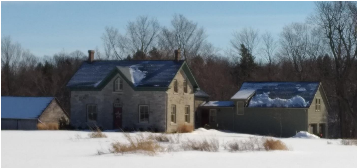
Figure 9: 2493 Highway 2, west of Gananoque, with a triangular topped upper central window (E. Tumak, Feb. 2021).

Several other Ontario cottage form residences with triangular topped central windows covered by a central cross gable are visible between Gananoque and Kingston and appear to be from the third quarter of the 19 th century.