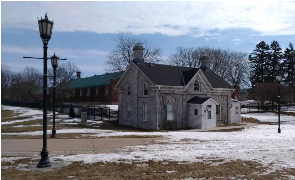
Figure 11: Building No. 2, Royal Military College, Kingston. It is one of two identical ashlar stone gatehouses at the entrance to the RMC Campus, with the other a short distance to the east also along Highway 2 (photo E. Tumak, March 2021). 8