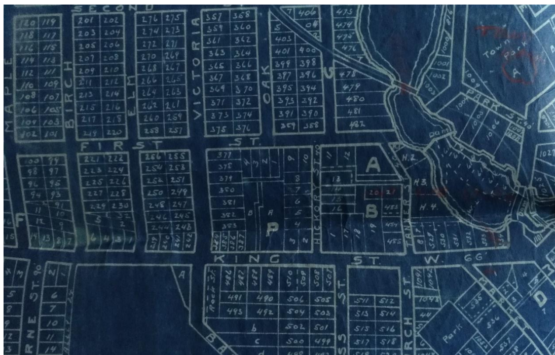
Figure 4: Blueprint, Map of the Town Gananoque, 1935 (E. Tumak collection).