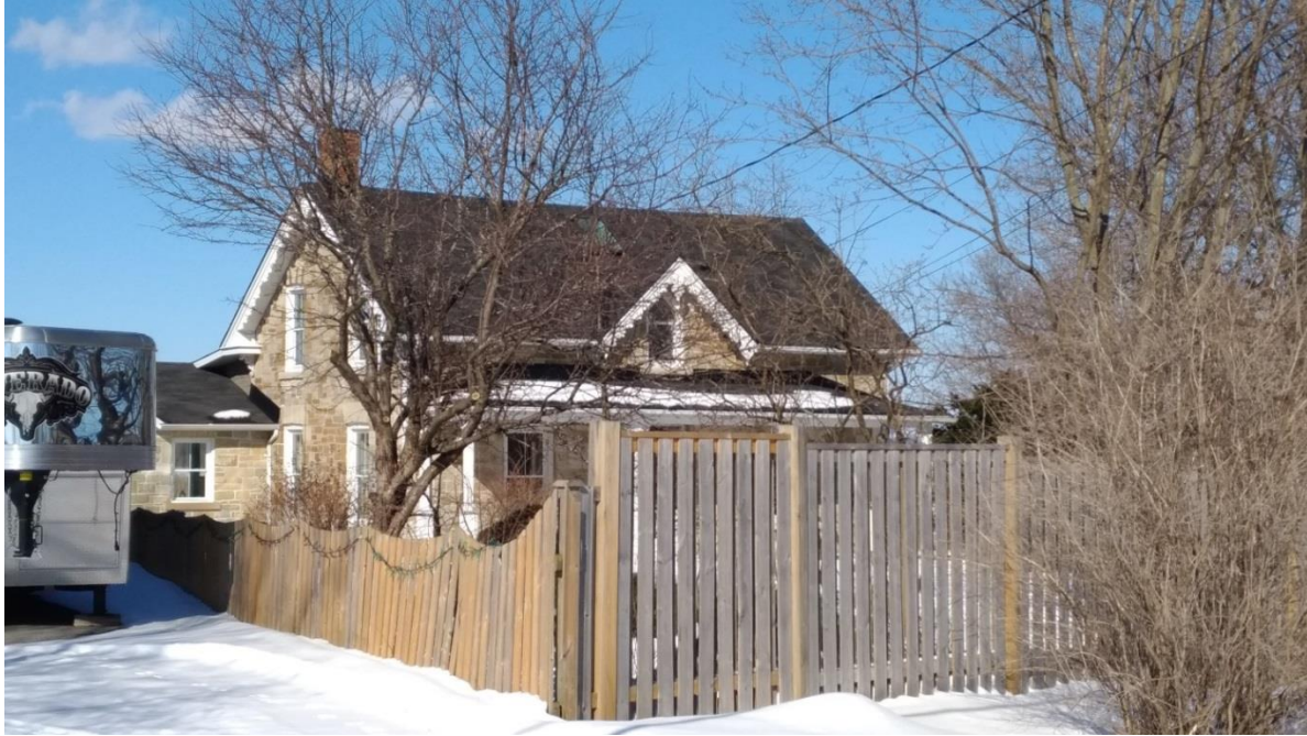
Figure 10: 2582 Highway 2, west of Gananoque, with a triangular topped upper central window (E. Tumak, Feb. 2021).