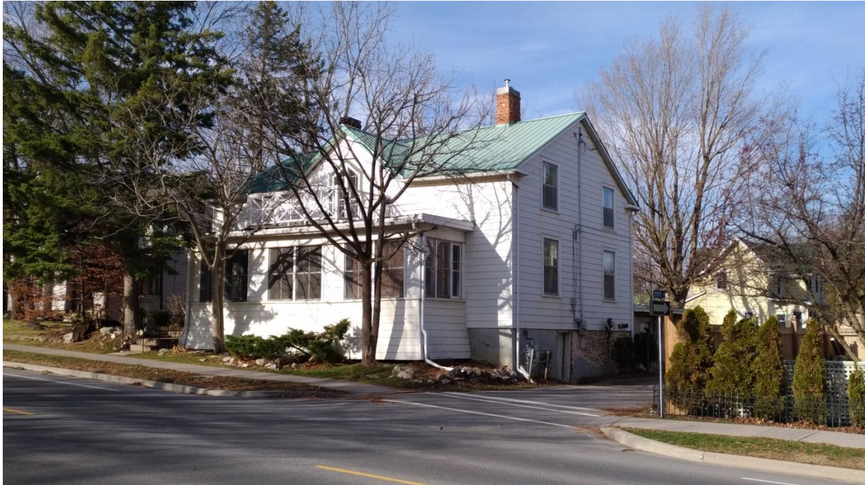
Figure 1: 120 King Street West, viewed from the southeast (E. Tumak, Nov. 2020).