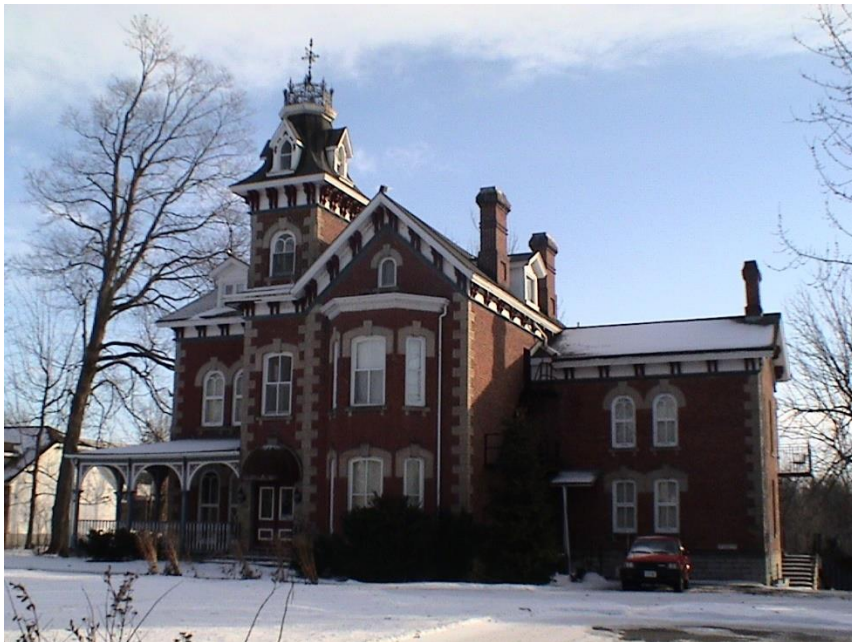
Figure 18: 279 King Street West, viewed from the northwest, former Samuel McCammon residence, 1872, in the Italian Villa style (photo E. Tumak, Jan., 2008).