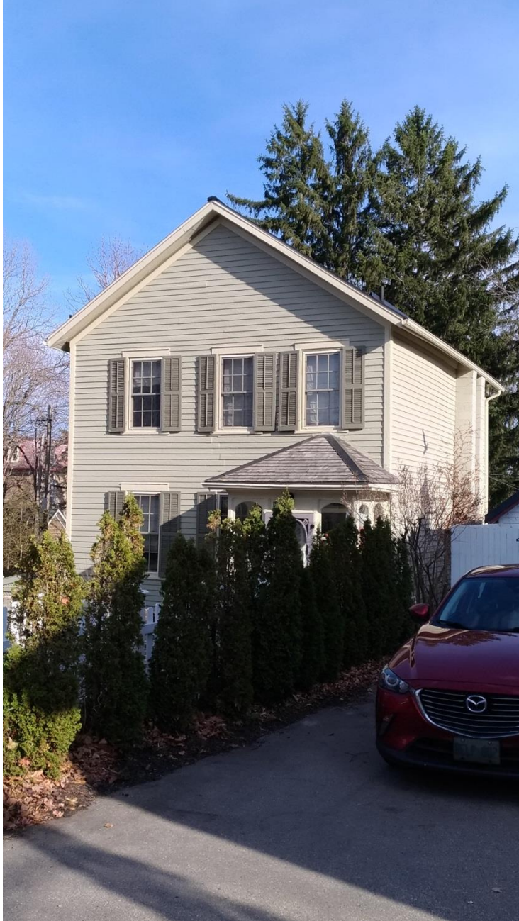
Figure 21: 11 Church Street, Gananoque, viewed from the southwest (E. Tumak, Nov. 2020).

11 Church Street is a front gable composition, clad with shiplap siding, with the interior organised on a side hall plan. Although all openings on the front elevation align vertically, the elevation is slightly asymmetrical with the south and middle openings closer together than the middle and north windows. The storm porch protecting the front entrance enriches the composition with its curved window heads, and more elaborate detailing than the main building.