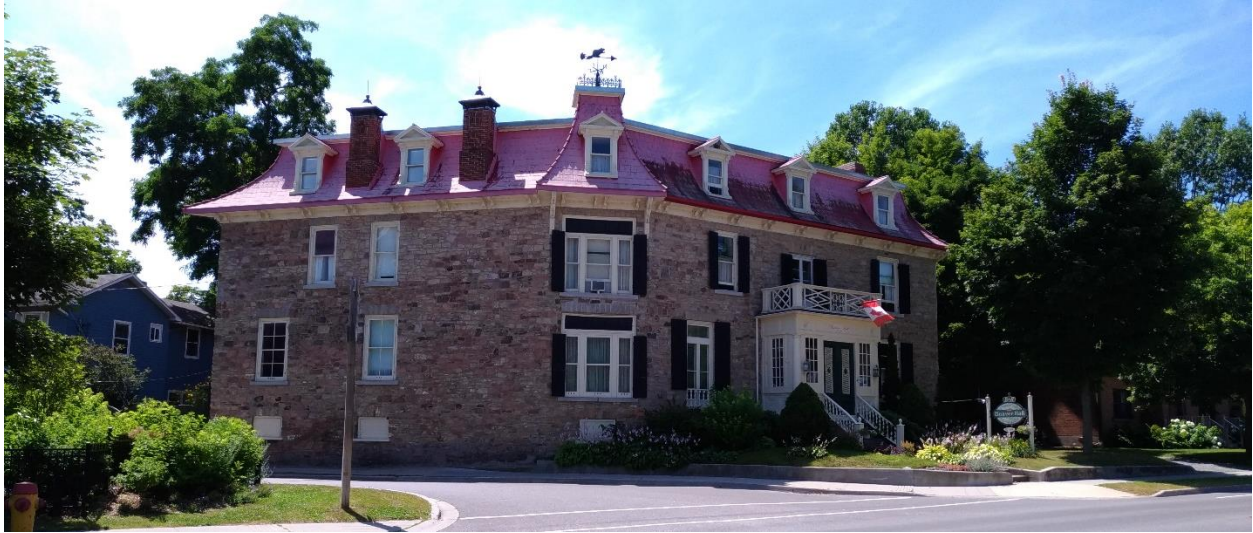
Figure 13: 75 King Street West, viewed from the northeast, originally the residence of Captain Chrysler, 1826, it was substantially modified in the 1870s 5 with notable additions from this later time being the corner pavilion with its wide windows and the bell cast mansard roof (E. Tumak, July 2019).