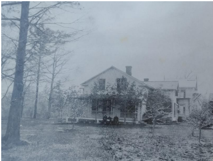
Figure 5: 70 Church Street, Beaumont Residence, built ca. mid-1850s, viewed from the east ca. 1900 with an adjoining component of what became 72 Church Street under construction on the far right/west. As seen below, the residence features windows with a triangulated top similar to Christ Church.

The construction of Christ Church was preceded by Beaumont House at the southern terminus of Church Street erected a few years before, making the Beaumont residence one of the oldest, if not oldest structure on the street. The original iteration of Beaumont House conforms to what now has the civic address of 70 Church Street, while the later attached west portion (with the separate civic address of 72 Church Street) is likely from ca. 1900. The Beaumonts were an early successful family that was not a direct line with the Stone-McDonald clan – the founding settler family of Gananoque. As neighbours and adherents of the English Church, the Beaumonts made their home available for the reception that followed the opening of Christ Church. 3 Another early structure in the immediate area, is the first rectory for Christ Church which was constructed immediately to the east of the church on Princess Street (no. 40).