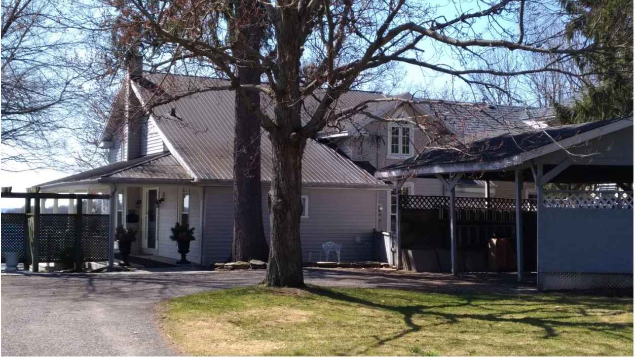
Figure 6: 70 Church Street viewed from the north, showing the triangular topped upper level window just right of centre (Edgar Tumak, April 2021).