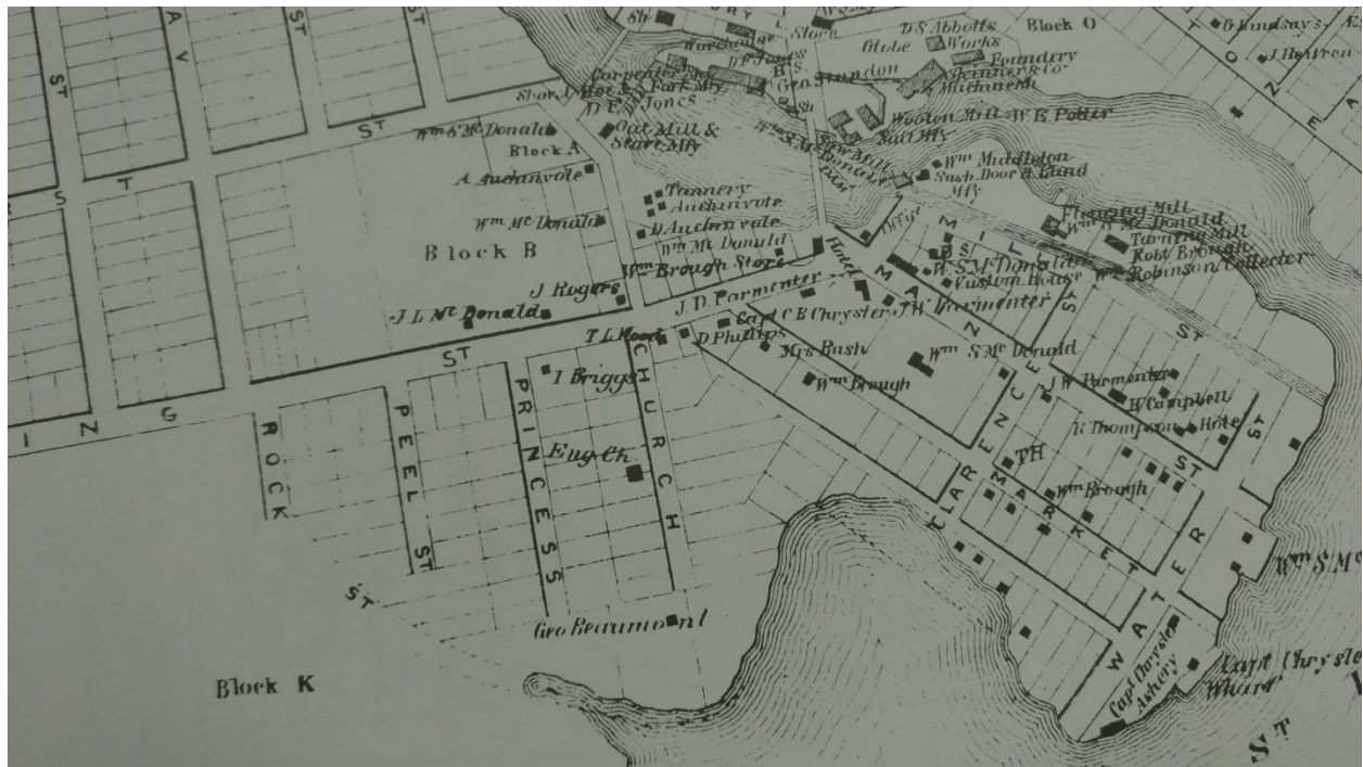
Figure 9: Detail of a plan of Gananoque, ca. 1858. The location of the English Church is noted just below centre (albeit not to scale or exact footprint), but not 11 Church Street, and neither the cemetery nor the union church on the east (right) side of Church Street at King (Illustrated Historical Atlas of the Counties of Leeds and Grenville, Canada West, from actual Surveys under the Direction of H.F. Walling (Kingston: Putnam & Walling Publishers, 1861-62, reprint ed. Belleville: Mika Publishing, 1973), p. 20.