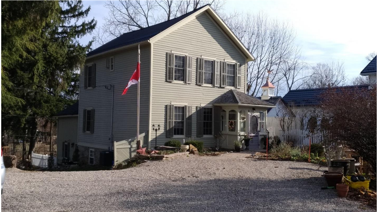
Figure 20: 11 Church Street, Gananoque, viewed from the northwest (E. Tumak, Nov. 2020).