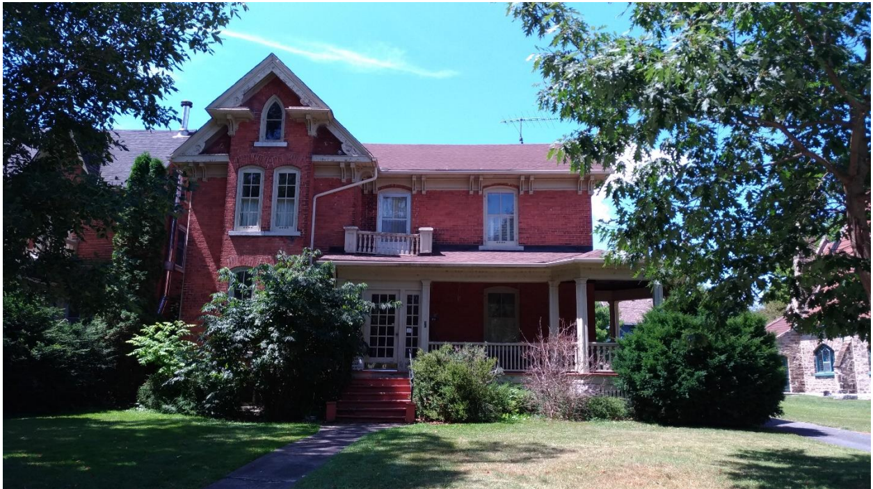
Figure 16: 40 Church Street, viewed from the east, showing Italianate references (paired eave brackets and segmental window arches) and Queen Anne Revival style projecting bay on the south (left) topped by a pointed arch window at the third level window.