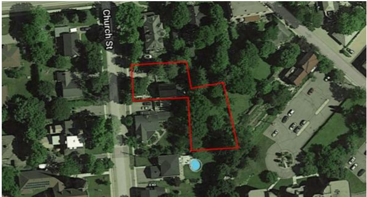
Figure 2: Property boundary of 11 Church Street, Gananoque, outlined in red. The rear portion (furthest from Church Street) is the portion contained in the broader parameters of the former burial ground ( https://www.onland.ca/ui/28/books/55093/viewer/699076608?page=189 , Google 2021, provided by the Town of Gananoque).