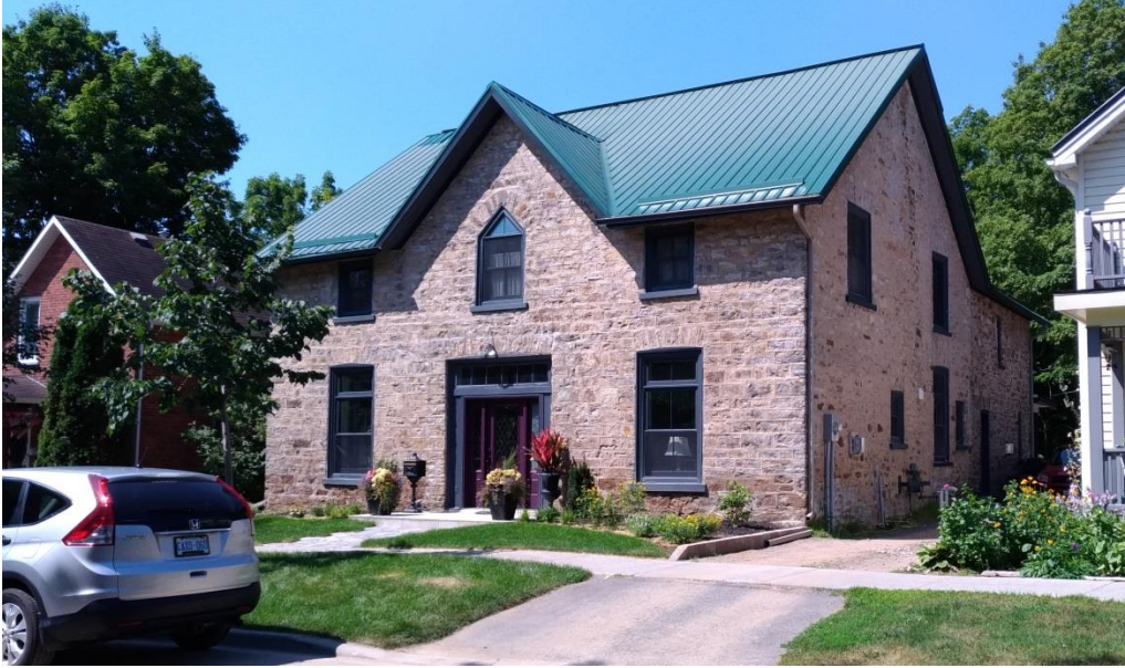
Figure 8: 40 Princess St., the first Christ Church Rectory, viewed from the northeast, built after the first phase of Christ Church 1857-58, enlarged at the rear late 1910s. It is an example of what is often called an Ontario cottage form with embellishments in the Regency style (1830-60) for the door surround and a triangular topped central upper window in a Gothic Revival style mode in keeping with most of the windows of the associated Christ Church.

The land on which 11 Church Street sits was formerly part of the 1797 Crown land grant to Joel Stone, the founder of Gananoque. In 1853 it became the property of his grandson, William Stone McDonald. Abstracts of deeds and mortgaging, along with 1850s maps of Gananoque, do not substantiate the presence of a structure at what is now 11 Church Street prior to the mid-1860s. However, a bit north, near what became the northeast side of Church Street, was a church shared by several denominations. 4 These were often called union churches, where different Christian sects worshipped at different times in the shared accommodation until the respective congregation had the means to construct their own dedicated worship space. The footprint of 11 Church Street (conforming to lot 1043) sits north of the former cemetery associated with that worship space (see Figures 9-11).