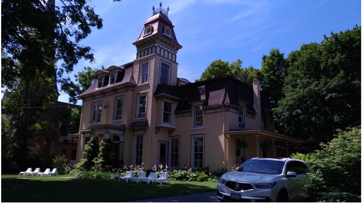
Figure 15: 22 Church Street, in the Italian Villa style, viewed from the northeast (E. Tumak, July 2019).