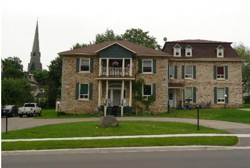
Figure 14: 181 King St. W, Gananoque, with the earlier section on the left with the entrance surround in the Neoclassical manner, and a later wing at the right/west with a Mansard type roof (photo E. Tumak, July 2009).