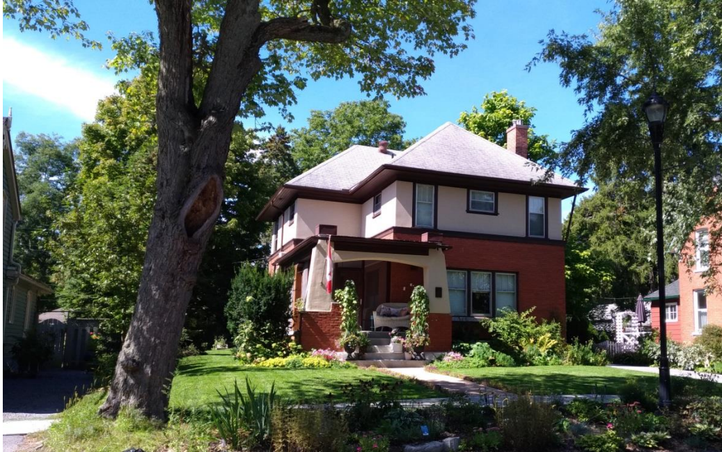
Figure 19: 16 Princess Street, second Christ Church Rectory, ca. 1900, viewed from the southeast (E. Tumak, Sept. 2019).