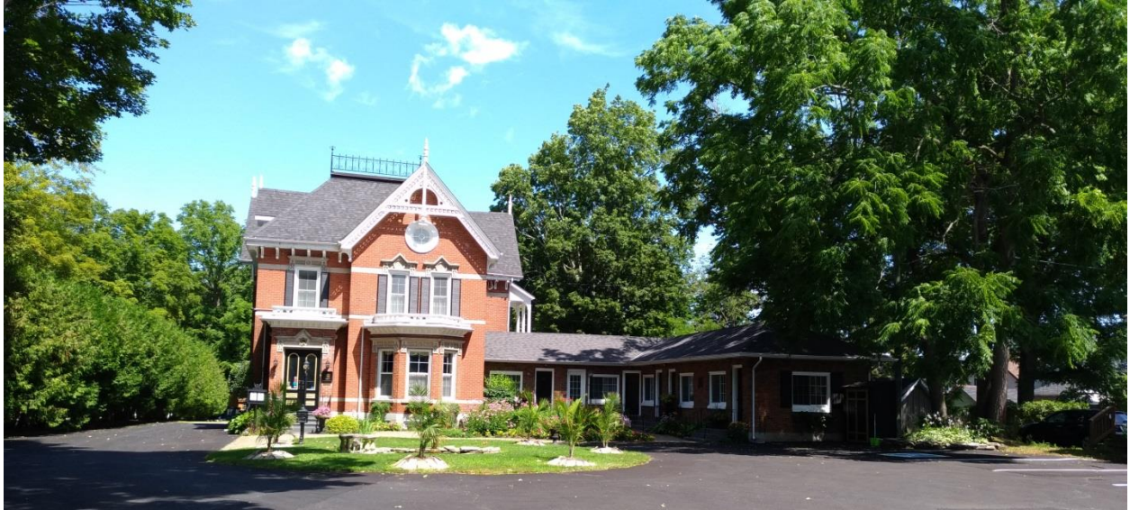
Figure 17: 250 King Street West, originally Woodview Villa, 1874-77, in the High Victorian style, viewed from the south, with motel units from the 1950s on the right (E. Tumak, July 2019).