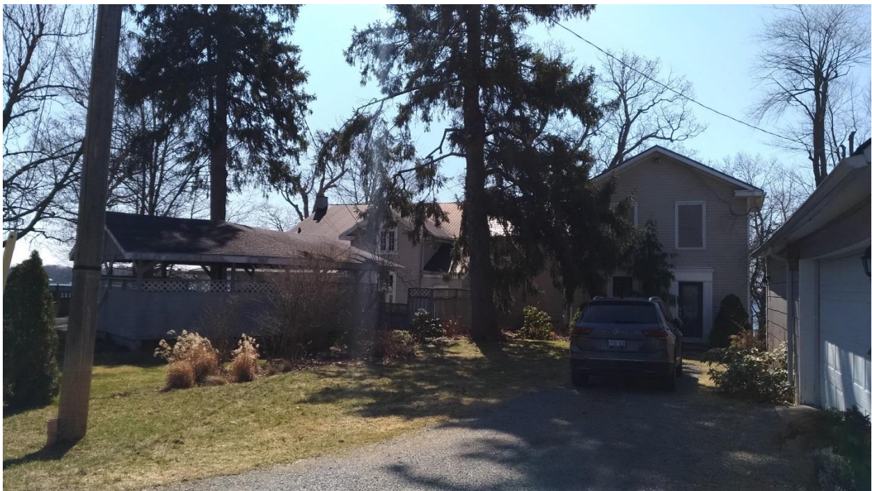
Figure 7: 72 Church Street viewed from the north, with the adjoining 70 Church Street on the left (Edgar Tumak, April 2021).