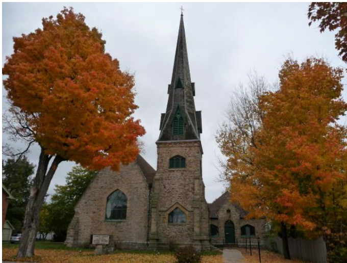
Figure 12: 30 Church Street, Christ Church, viewed from the east, with the nave (1857-58) on the south/left, tower and spire in the centre (spire completed 1880), and the parish hall on the north/right (1901), built in the Gothic Revival style but with most window heads unusually featuring a triangulated top rather than a curved pointed arch (photo E. Tumak, Oct. 2009).

Properties from the third quarter of the 19 th century on Church, Princess and King streets illustrate the development of which 11 Church Street was part, although it was neither the earliest or grandest of houses constructed in this area at the time or shortly thereafter (see Figures 12-19).