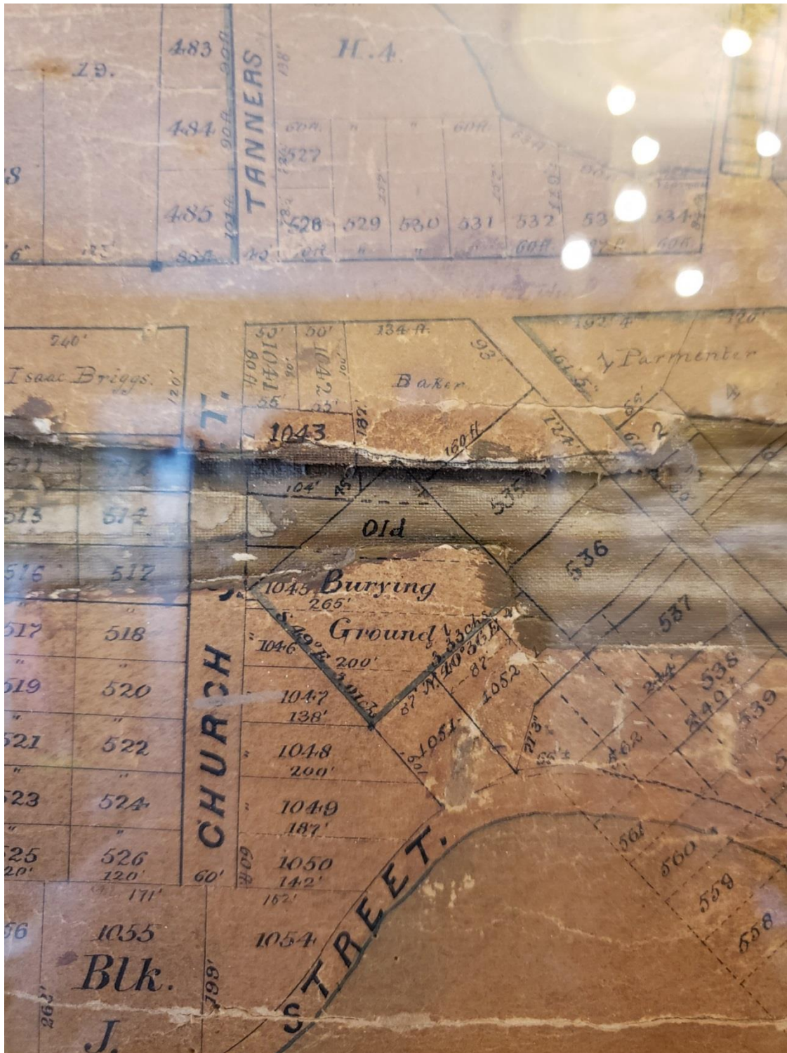
Figure 11: Detail of development Plan 86, showing the “Old Burying Ground” in the lower centre, and the overlap of the cemetery with lot 1043 (Map of the Incorporated Town of Gananoque in the Township and County of Leeds, Ontario, 1885, original displayed in the Planning Dept., Town of Gananoque, 2020).