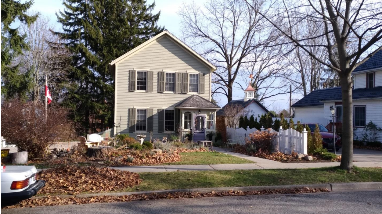
Figure 1: Front elevation, 11 Church Street, Gananoque, viewed from the west (E. Tumak, Nov. 2020).

HERITAGE ANALYSIS REPORT: REAPPRAISAL, by Edgar Tumak Heritage, 2021, Architectural Historian, MSc Architecture, CAHP