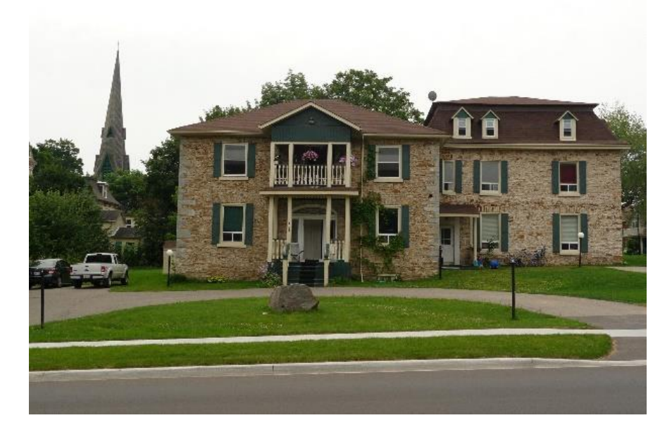
Figure 14: 181 King St. W, Gananoque, with the earlier section on the left with the entrance surround in the Neoclassical manner, and a later wing at the right/west with a Mansard type roof (photo E. Tumak, July 2009).