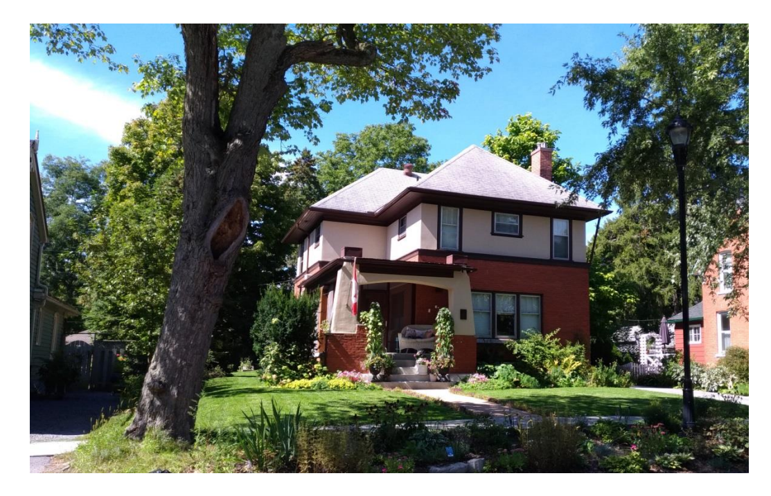
Figure 19: 16 Princess Street, second Christ Church Rectory, ca. 1900, viewed from the southeast.