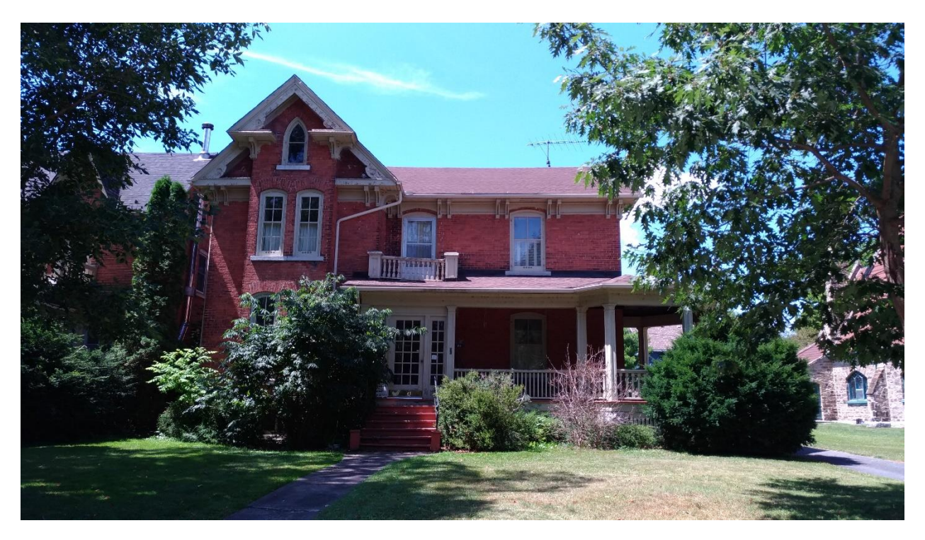
Figure 16: 40 Church Street, viewed from the east, showing Italianate references (paired eave brackets and segmental window arches) and Queen Anne Revival style projecting bay on the south (left) topped by a pointed arch window at the third level window (E. Tumak, July 2019).