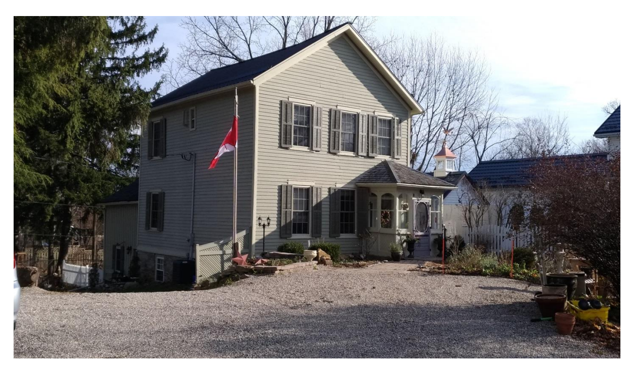
Figure 20: 11 Church Street, Gananoque, viewed from the northwest (E. Tumak, Nov. 2020).