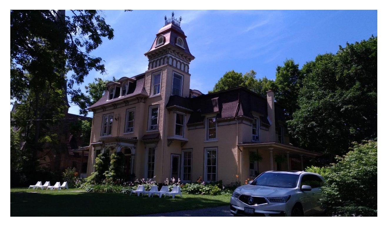
Figure 15: 22 Church Street, in the Italian Villa style, viewed from the northeast (E. Tumak, July 2019).