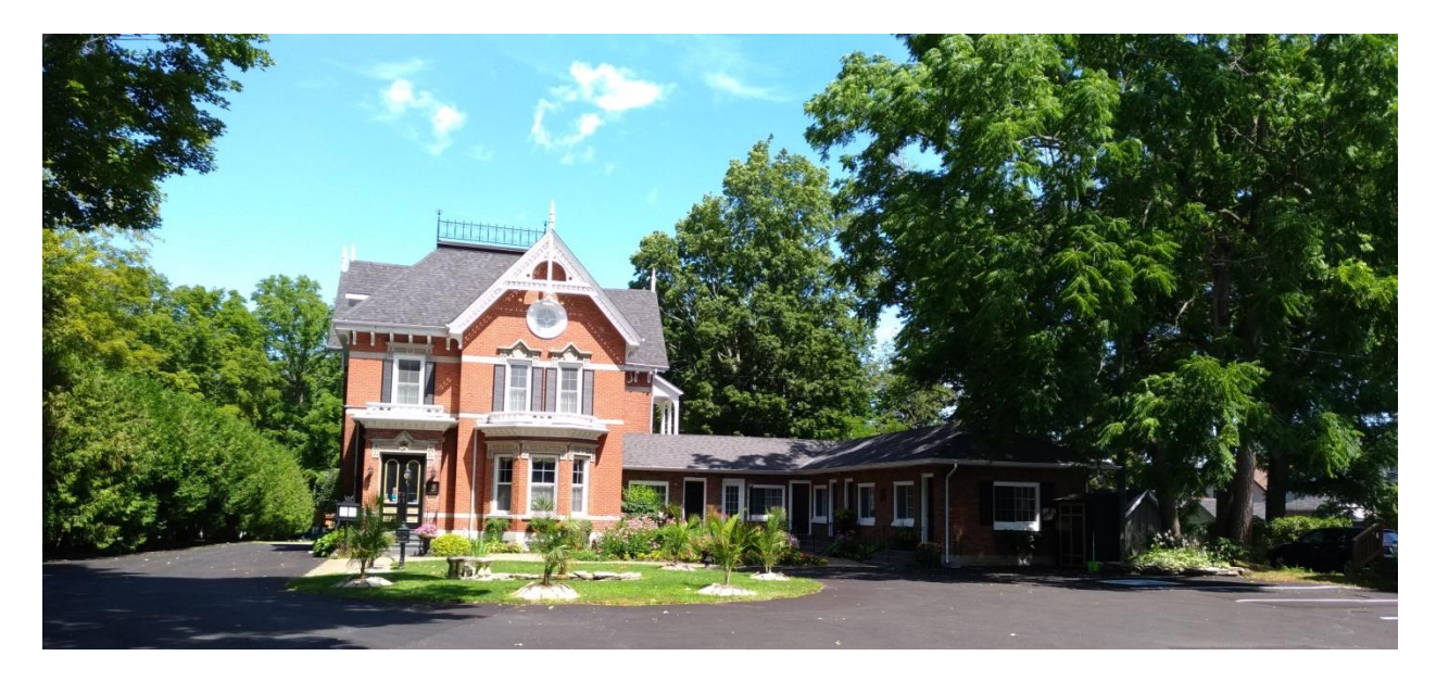
Figure 17: 250 King Street West, originally Woodview Villa, 1874-77, in the High Victorian style, viewed from the south, with motel units from the 1950s on the right.