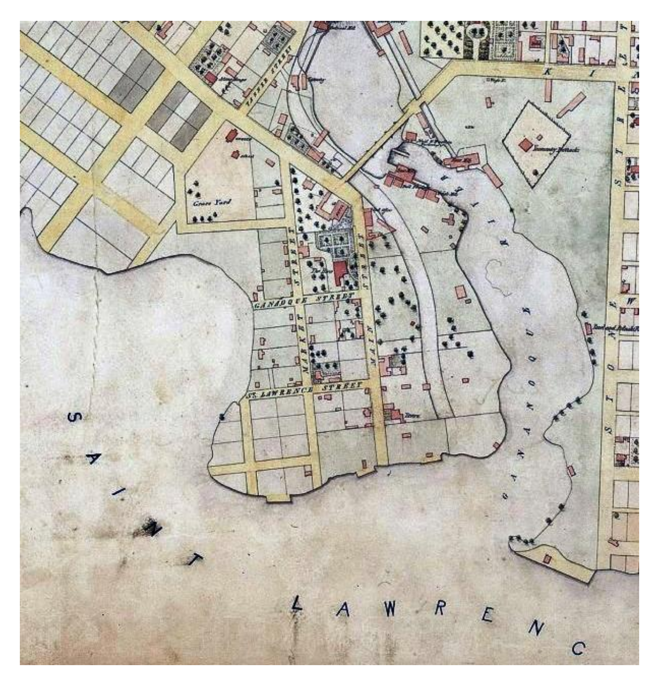
Figure 10: Detail of a plan of Gananoque, dated 1858, but likely composed earlier as not only is Church Street unnamed, but it does not conform to its current southerly alignment with Tanner Street. Further, structures that existed at the time are not shown (e.g., Christ Church, and the Beaumont residence). However, the location of the "Grave Yard" on which 11 Church Street sits (upper left corner), and a church and school at the juncture of King Street, opposite Tanner, are shown. (Library and National Archives of Canada Source link: <u>https://www.bac-</u>

lac.gc.ca/eng/CollectionSearch/Pages/record.aspx?app=FonAndCol&IdNumber=4134683).