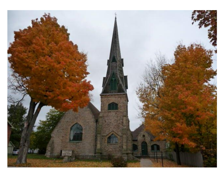
Figure 12: 30 Church Street, Christ Church, viewed from the east, with the nave (1857-58) on the south/left, tower and spire in the centre (spire completed 1880), and the parish hall on the north/right (1901), built in the Gothic Revival style but with most window heads unusually featuring a triangulated top rather than a curved pointed arch (photo E. Tumak,Oct. 2009).

Properties from the third quarter of the 19<sup>th</sup> century on Church, Princess and King streets illustrate the development of which 11 Church Street was part, although it was neither the earliest or grandest of houses constructed in this area at the time or shortly thereafter (see Figures 12-19).