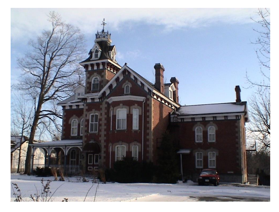
Figure 18: 279 King Street West, viewed from the northwest, former Samuel McCammon residence, 1872, in the Italian Villa style (photo E. Tumak, Jan., 2008).