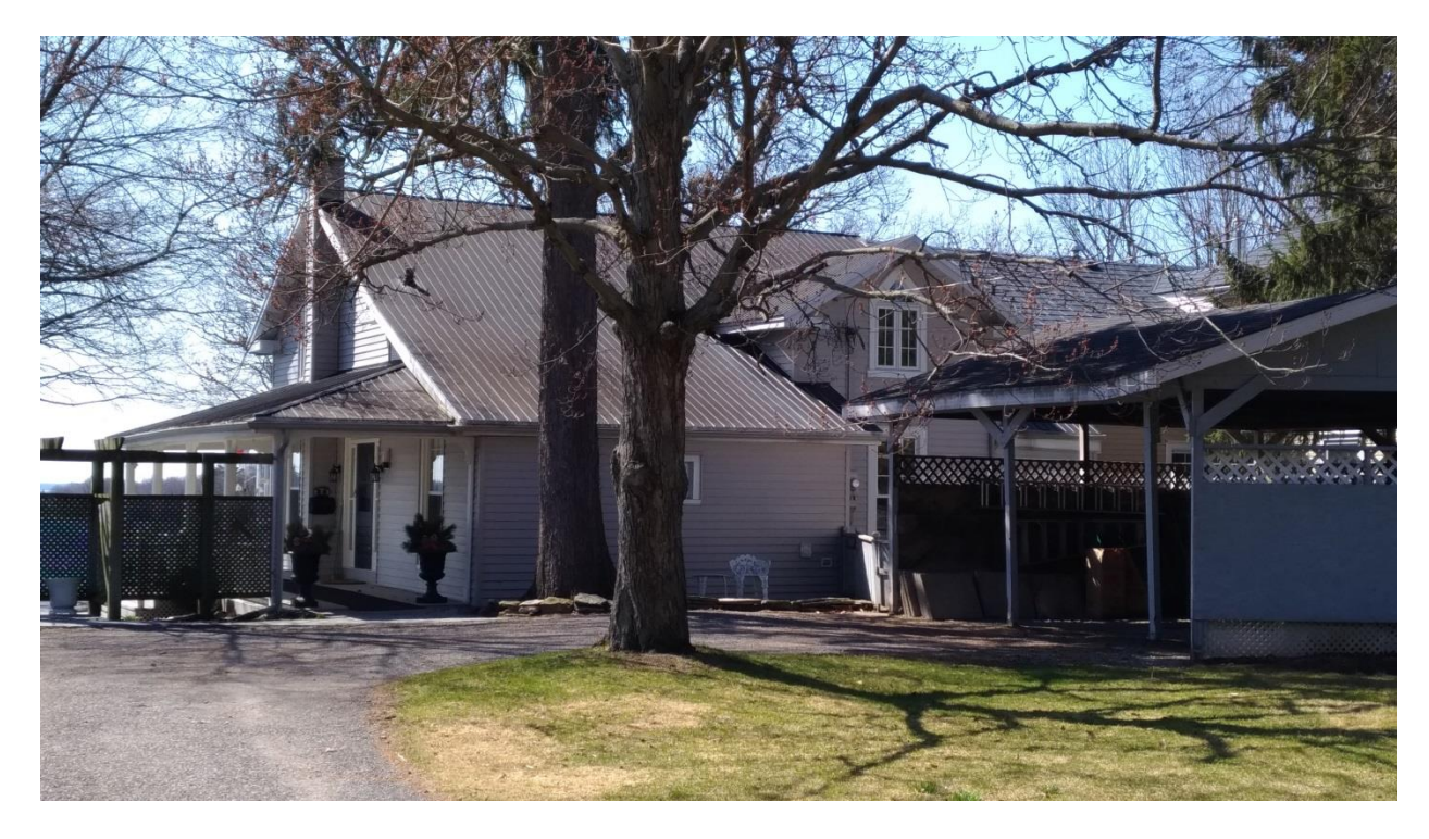
Figure 6: 70 Church Street viewed from the north, showing the triangular topped upper level window just right of centre (Edgar Tumak, April 2021).