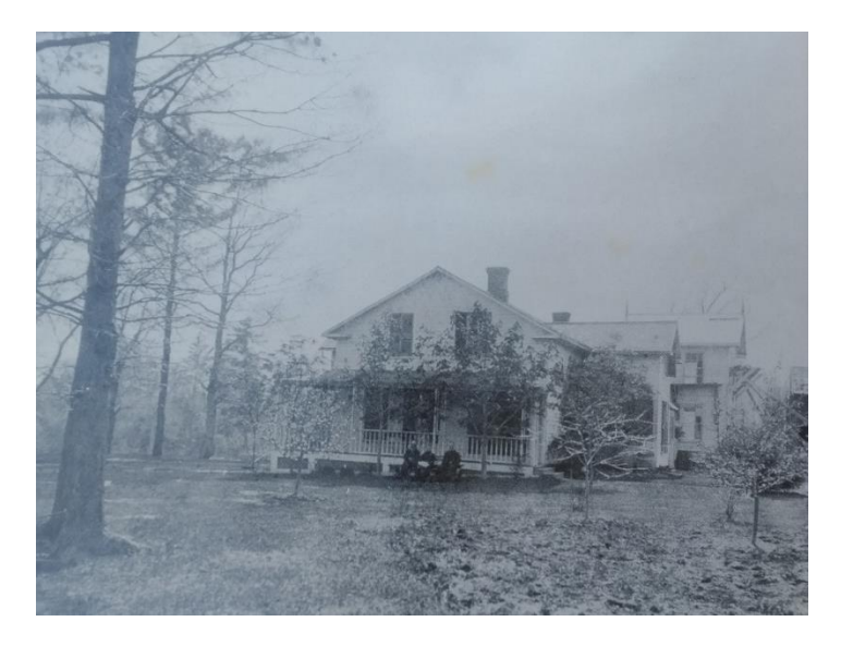
Figure 5: 70 Church Street, Beaumont Residence, built ca. mid-1850s, viewed from the east ca. 1900 with an adjoining component of what became 72 Church Street under construction on the far right/west. As seen below, the residence features windows with a triangulated top similar to Christ Church.

The construction of Christ Church was preceded by Beaumont House at the southern terminus of Church Street erected a few years before, making the Beumont residence one of the oldest, if not oldest structure on the street. The original iteration of Beaumont House conforms to what now has the civic address of 70 Church Street, while the later attached west portion (with the separate civic address of 72 Church Street) is likely from ca. 1900. The Beaumonts were an early successful family that was not a direct line with the Stone-McDonald clan – the founding settler family of Gananoque. As neighbours and adherents of the English Church, the Beaumonts made their home available for the reception that followed the opening of Christ Church.<sup>3</sup> Another early structure in the immediate area, is the first rectory for Christ Church which was constructed immediately to the east of the church on Princess Street (no. 40).