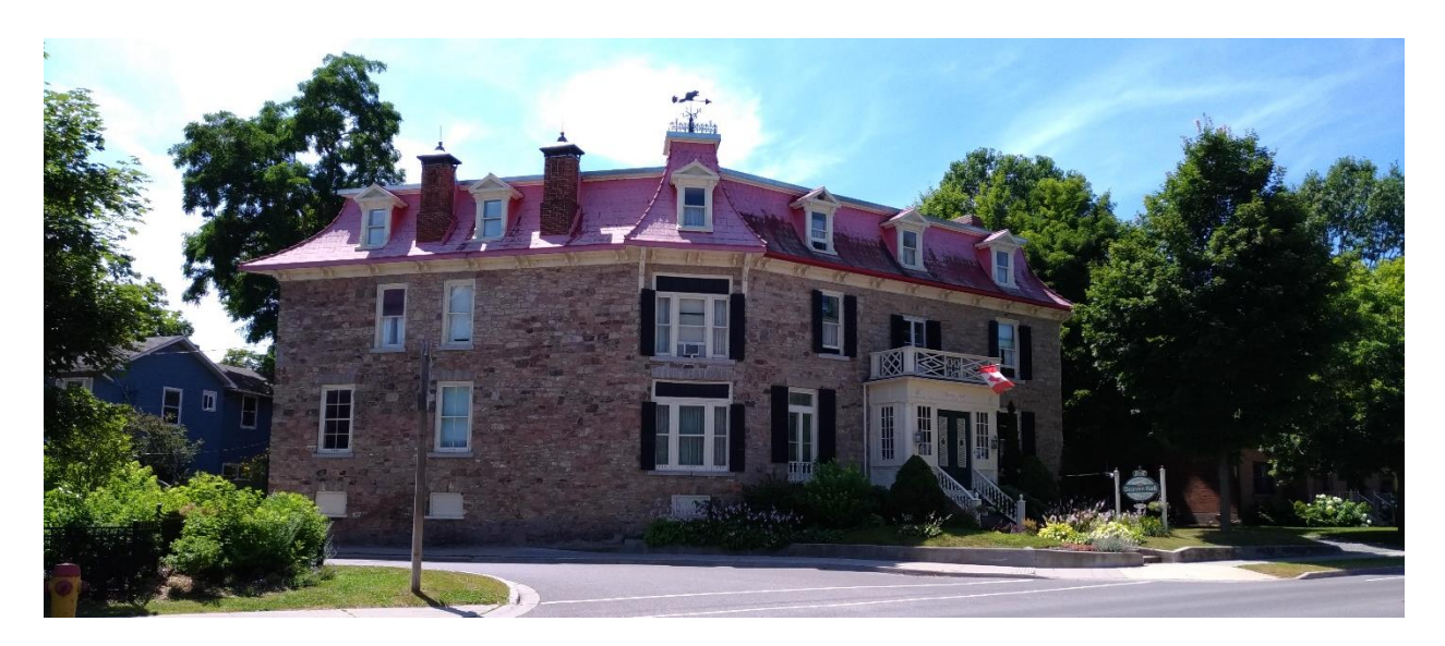
Figure 13: 75 King Street West, viewed from the northeast, originally the residence of Captain Chrysler, 1826, it was substantially modified in the 1870s^5 with notable additions from this later time being the corner pavilion with its wide windows and the bell cast mansard roof.