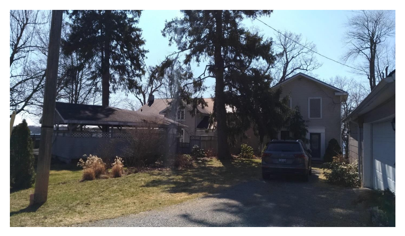
Figure 7: 72 Church Street viewed from the north, with the adjoining 70 Church Street on the left (Edgar Tumak, April 2021).