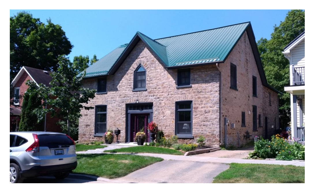
Figure 8: 40 Princess St., the first Christ Church Rectory, viewed from the northeast, built after the first phase of Christ Church 1857-58, enlarged at the rear late 1910s. It is an example of what is often called an Ontario cottage form with embellishments in the Regency style (1830-60) for the door surround and a triangular topped central upper window in a Gothic Revival style mode in keeping with most of the windows of the associated Christ Church (photo E. Tumak, July 2009).

The land on which 11 Church Street sits was formerly part of the 1797 Crown land grant to Joel Stone, the founder of Gananoque. In 1853 it became the property of his grandson, William Stone McDonald. Abstracts of deeds and mortgaging, along with 1850s maps of Gananoque, do not substantiate the presence of a structure at what is now 11 Church Street prior to the mid-1860s. However, a bit north, near what became the northeast side of Church Street, was a church shared by several denominations.<sup>4</sup> These were often called union churches, where different Christian sects worshipped at different times in the shared accommodation until the respective congregation had the means to construct their own dedicated worship space. The footprint of 11 Church Street (conforming to lot 1043) sits north of the former cemetery associated with that worship space (see Figures 9-11).