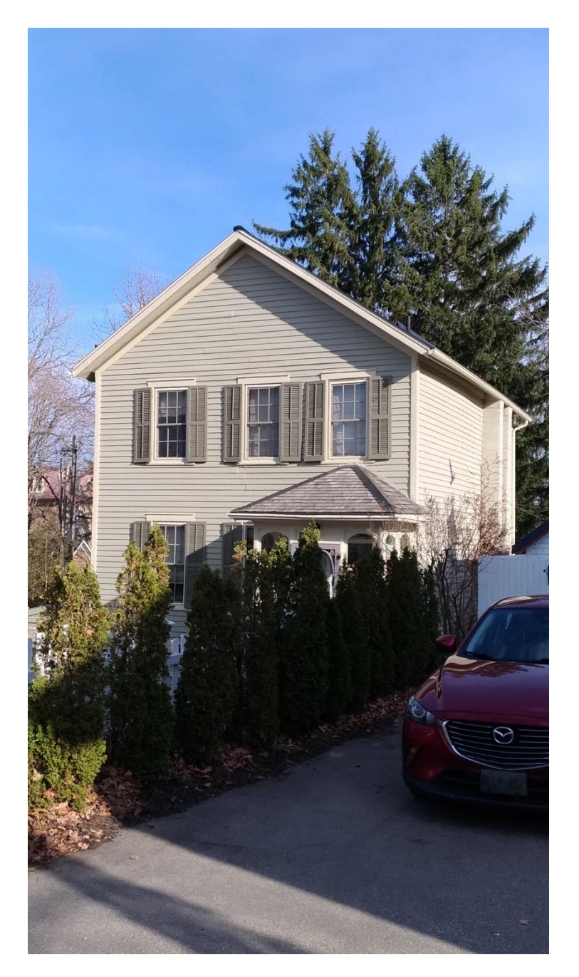
Figure 21: 11 Church Street, Gananoque, viewed from the southwest (E. Tumak, Nov. 2020).

11 Church Street is a front gable composition, clad with shiplap siding, with the interior organised on a side hall plan. Although all openings on the front elevation align vertically, the elevation is slightly asymmetrical with the south and middle openings closer together than the middle and north windows. The storm porch protecting the front entrance enriches the composition with its curved window heads, and more elaborate detailing than the main building.