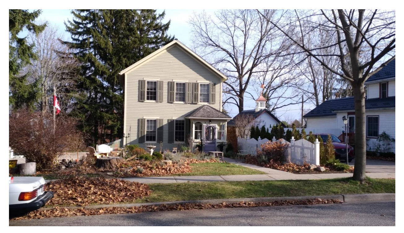
Figure 1: Front elevation, 11 Church Street, Gananoque, viewed from the west (E. Tumak, Nov. 2020).