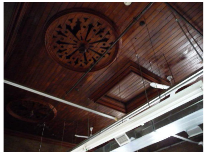
Figures 10-12: left – Gananoque Pump House, interior paralleling Kate Street; right – ceiling of chamber paralleling Kate Street; top of next page – detail of ceiling.