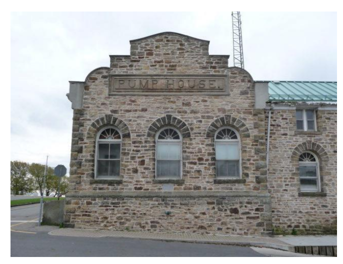
Figures 3-4: left – Gananoque Pump House, viewed from the north, with the northeast/Kate Street elevation on the left, and the northwest/St. Lawrence Street elevation on the right; right – north gable viewed from St. Lawrence Street (photos E. Tumak, July 2009).