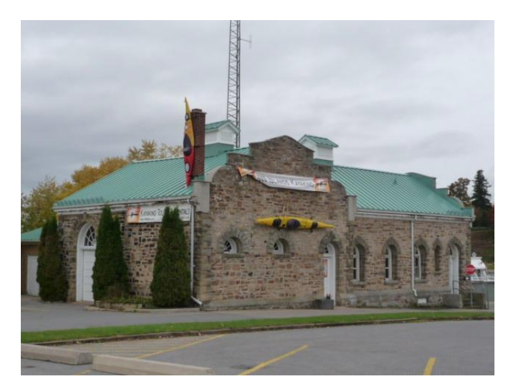
Figure 1:Gananoque Pump House, viewed from the east, with the northeast/Kate St. elevation on the right, and the southeast elevation (towards Water St.) on the left.