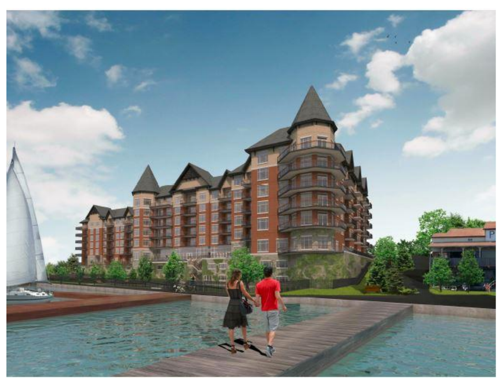
Figure 7: View of the development from southeast.