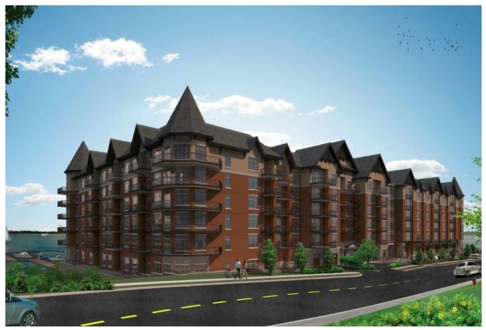
Figure 9: View of the development from northeast.

Landscaping is proposed throughout the site and along South and Stone Streets to provide a high quality amenity area. Trees and shrubs are also proposed around the entrances to the underground parking garage and along the stone foundation walls to soften the views. A 1.5 metre wide sidewalk is proposed along the north side of the building along South Street for use by residents and visitors of the development and the community more largely.