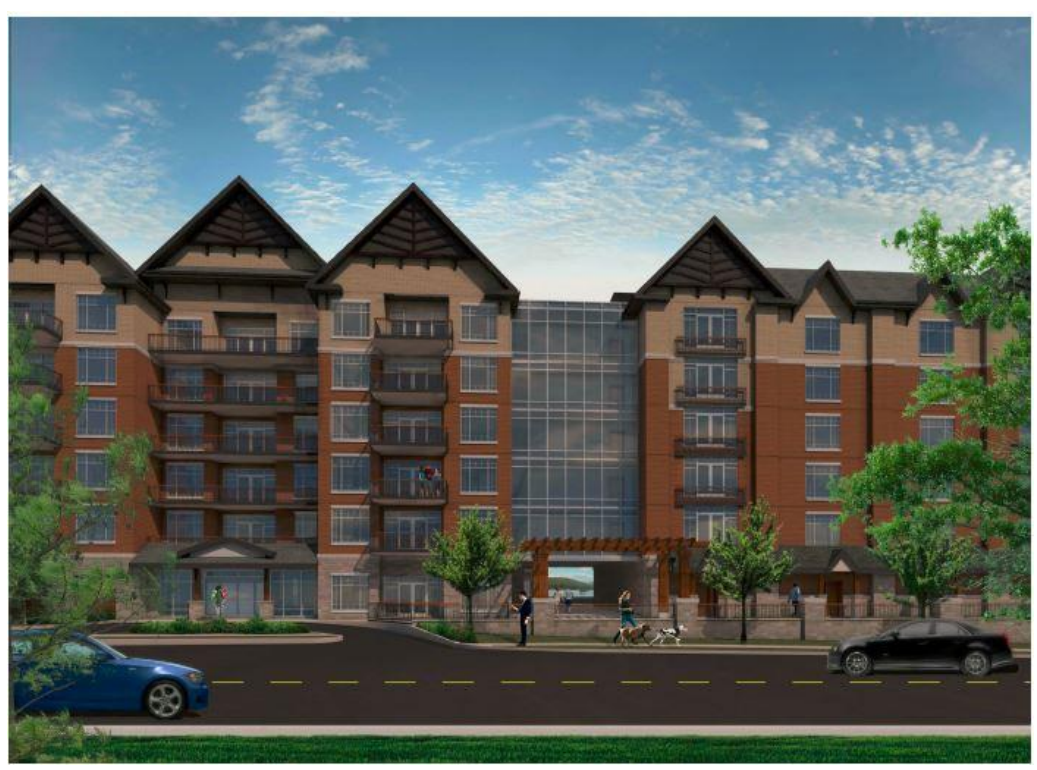
Figure 6: View of the development looking south from South Street.