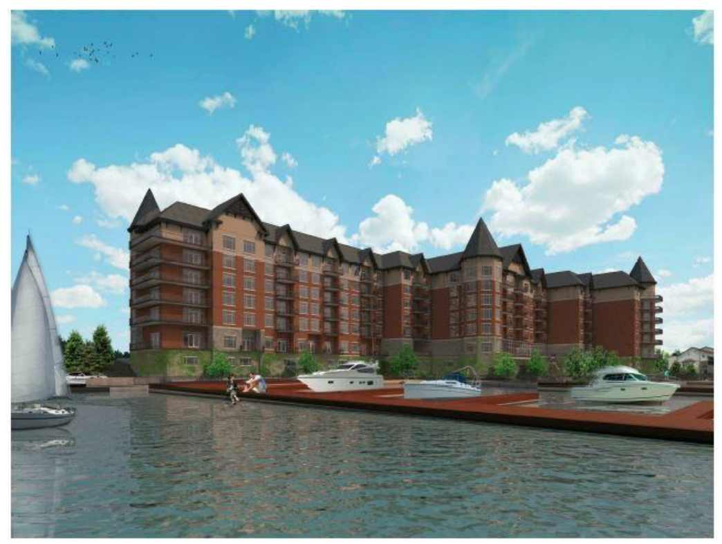
Figure 5: View of the development from southwest.