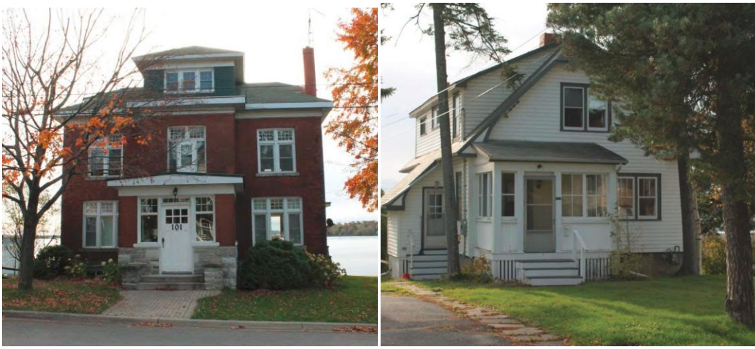
Figure 2: Former residential uses.