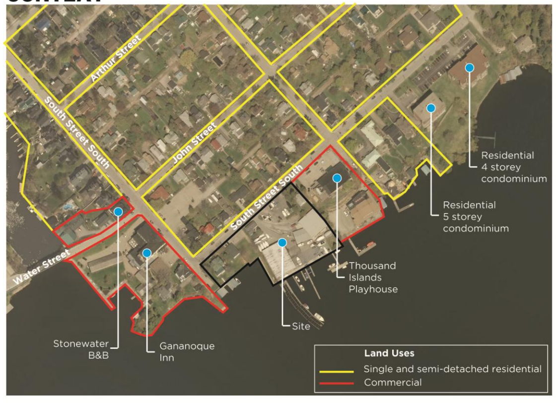
Figure 3: Site Context

South Street represents the immediate northern boundary of the subject property with low density residential uses on the north side of the street. The lands to the east of the property include the Thousand Island Playhouse. The Playhouse property is occupied by two buildings. The Firehall Theatre is located at street level and Springer Theatre is on the waterfront. Beyond the Playhouse there exists a mix of low and higher density residential uses including single detached dwellings and two condominiums, one 4 and one 5 storey building at the street. The St. Lawrence River directly abuts the property to the south and west of Stone Street is a commercial development known as the Gananoque Inn.