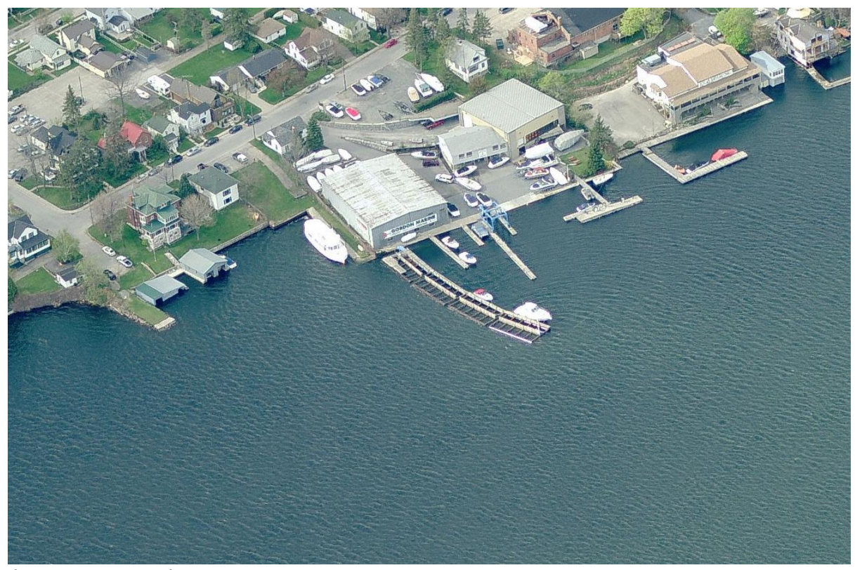
Figure 1: Former marina use.