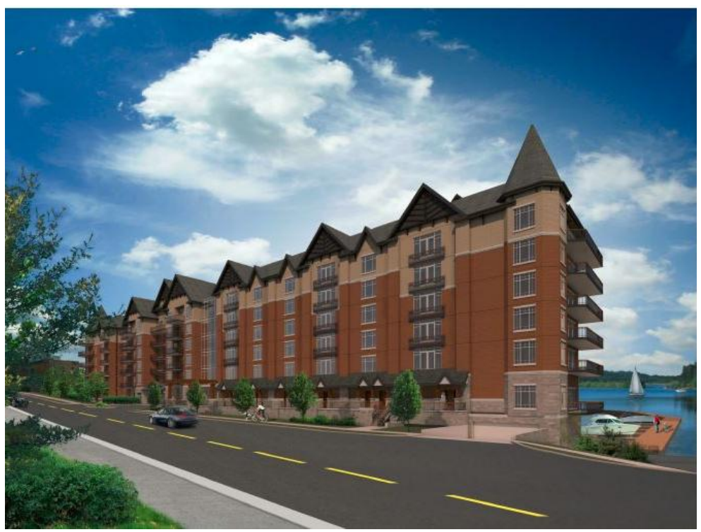
Figure 8: View of the development from northwest.