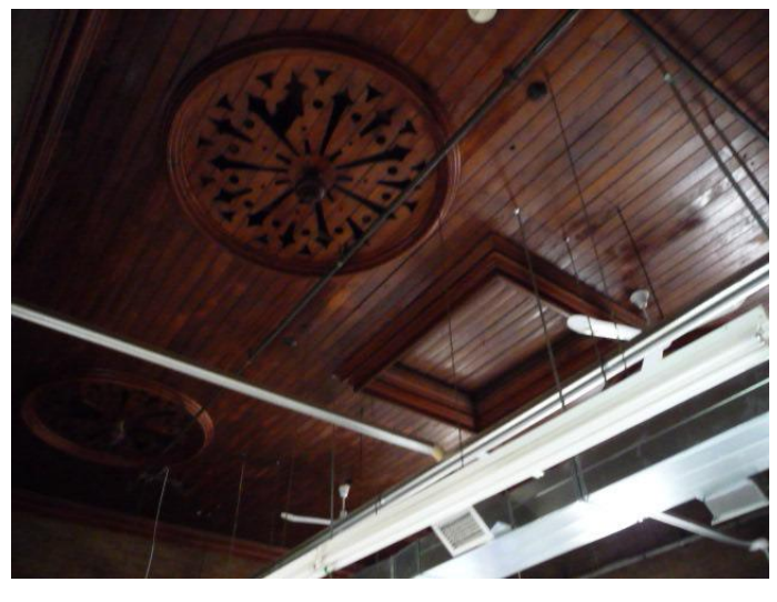
Figures 10-12: left – Gananoque Pump House, interior paralleling Kate Street; right – ceiling of chamber paralleling Kate Street; top of next page – detail of ceiling (photos E. Tumak, July 2009).