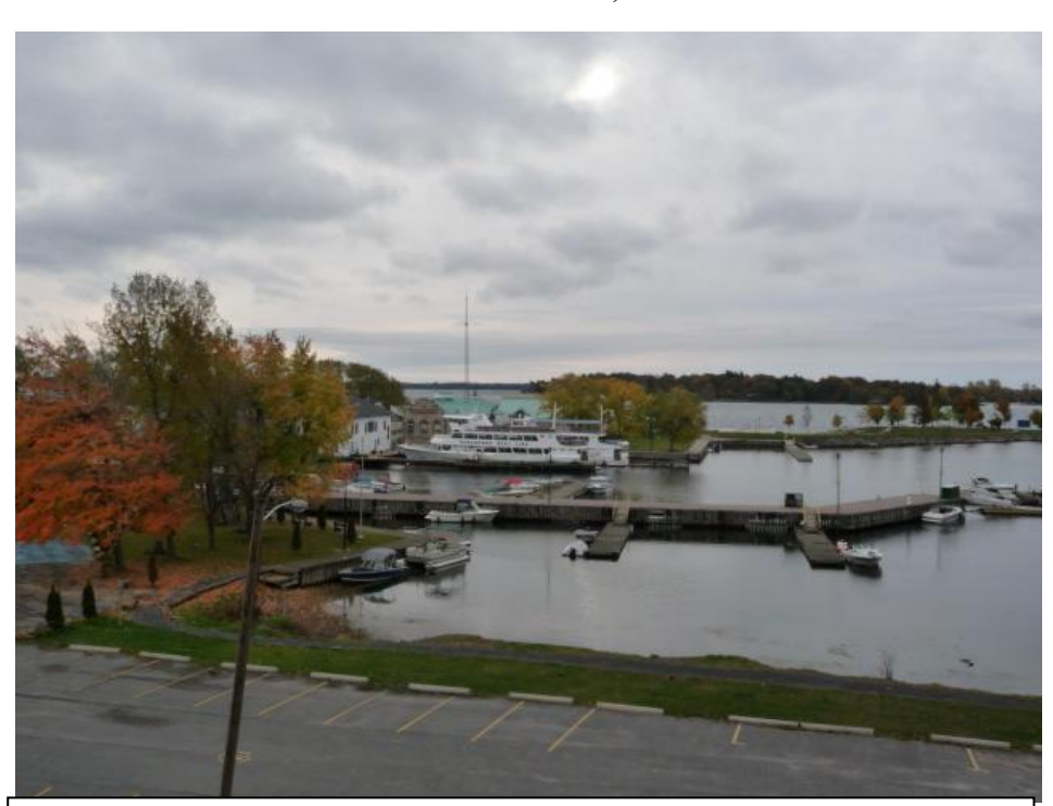
Figure 16: Gananoque Pump House and environs, viewed from the northwest from Church Street (photo E. Tumak, Oct. 2009). The northwest gable of the Pump House facing St. Lawrence Street is by the front of the large tour boat.

Pump House is that the traditional, tall smoke stack for the steam-