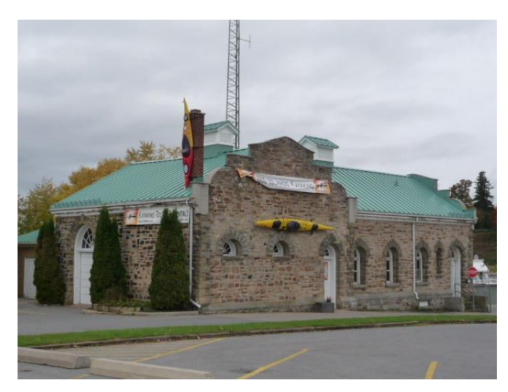
Figure 1:Gananoque Pump House, viewed from the east, with the northeast/Kate St. elevation on the right, and the southeast elevation (towards Water St.) on the left (photo E. Tumak, Oct. 2009).